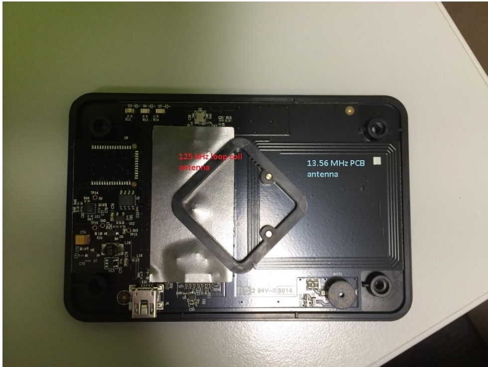
PHOTO 1 - PCB in base housing