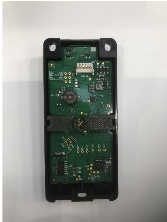
Photo 4. Back View, unpotted