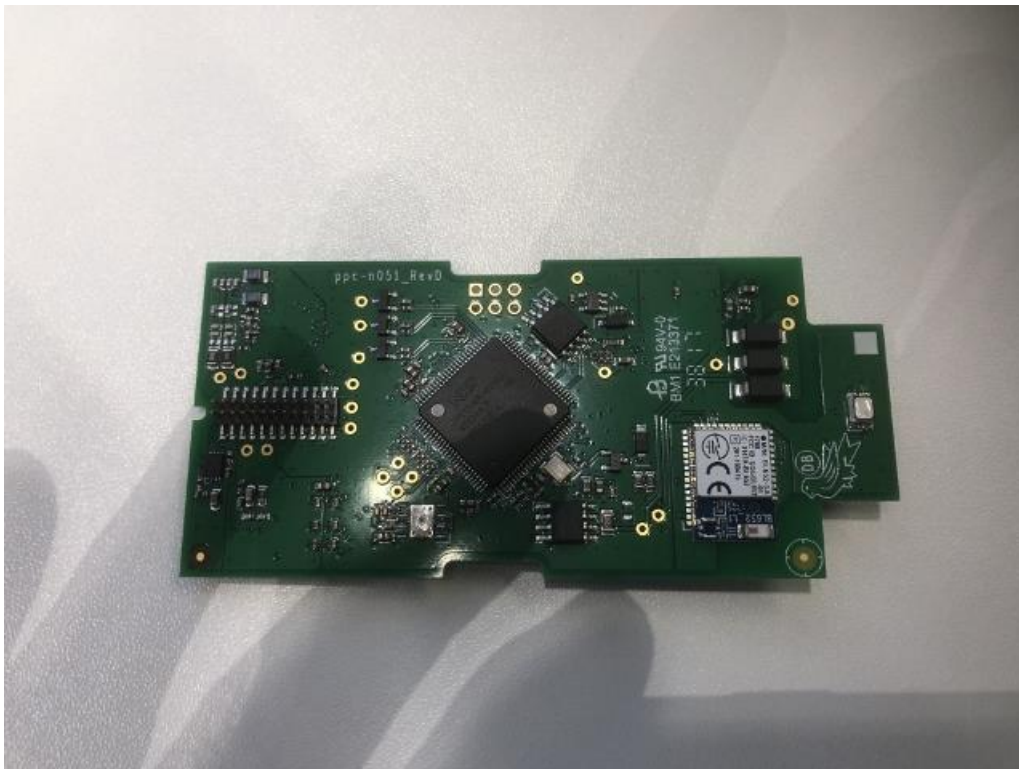
Photo 2. Main PCB Top View