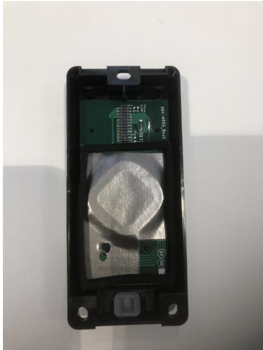
Photo 5. Back View, with main PCB removed