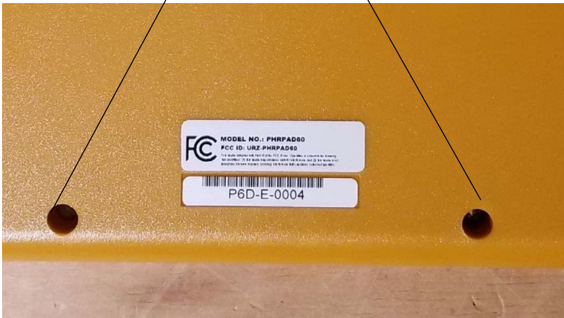
Photograph of label installed on the back of a PHRPAD unit