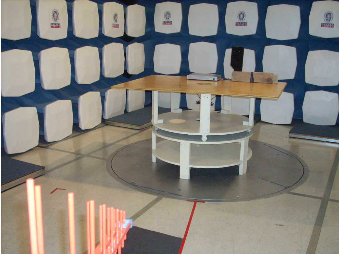
Radiated EMI above 30MHz