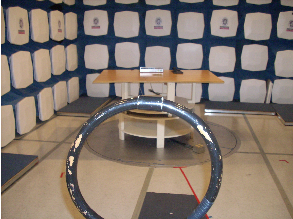
Fundamental and Harmonics Below 30MHz