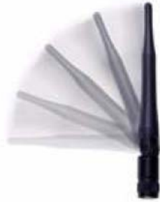
Dimensions and Mounting Specifications