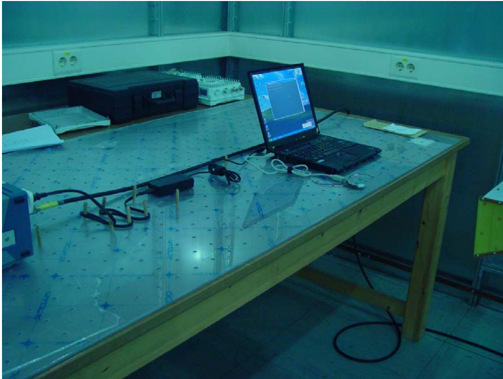
Conducted Emissions Test Setup 1