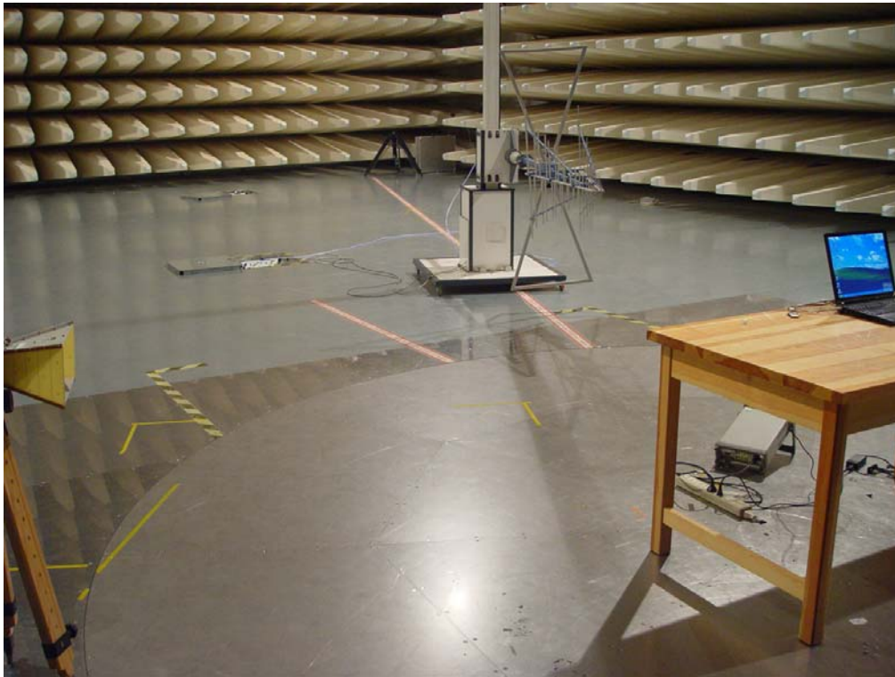
Radiated Emissions Test Setup 1