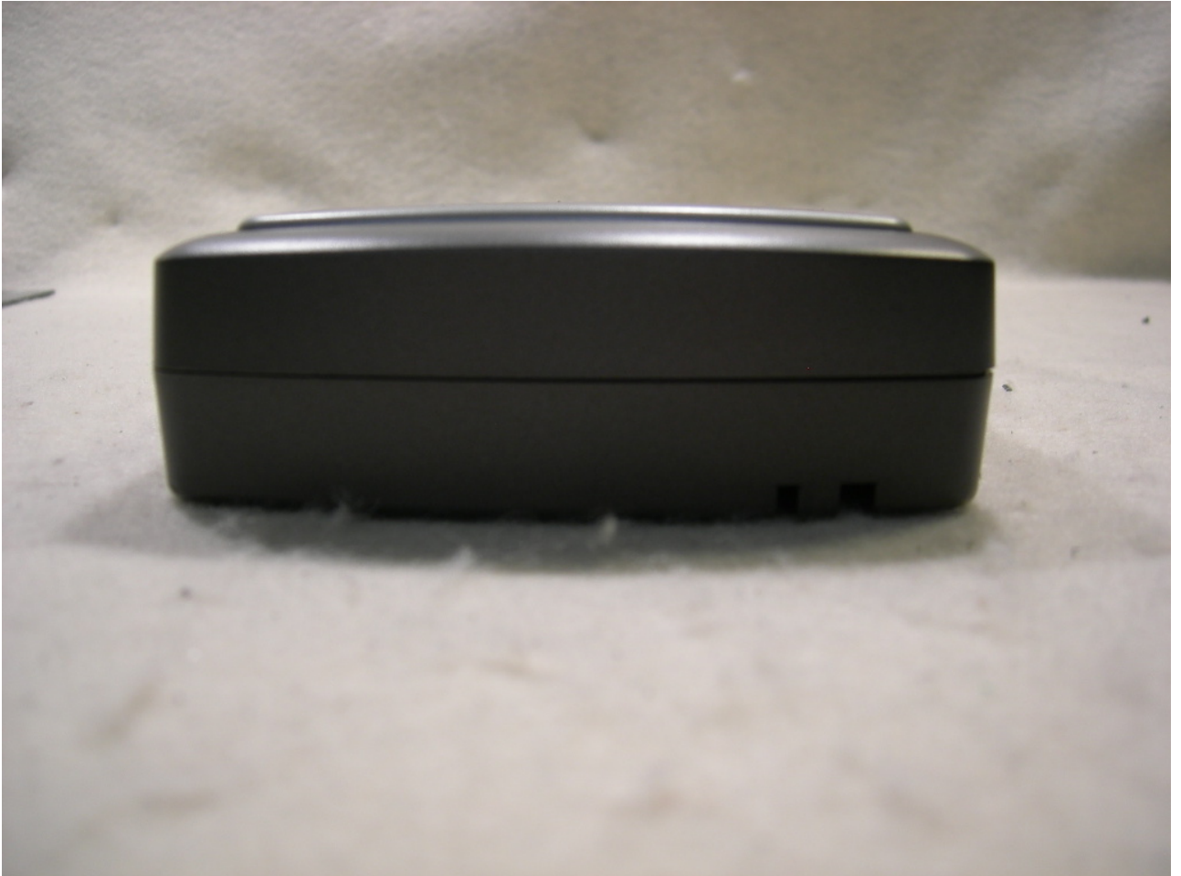
Figure 4: Bottom View