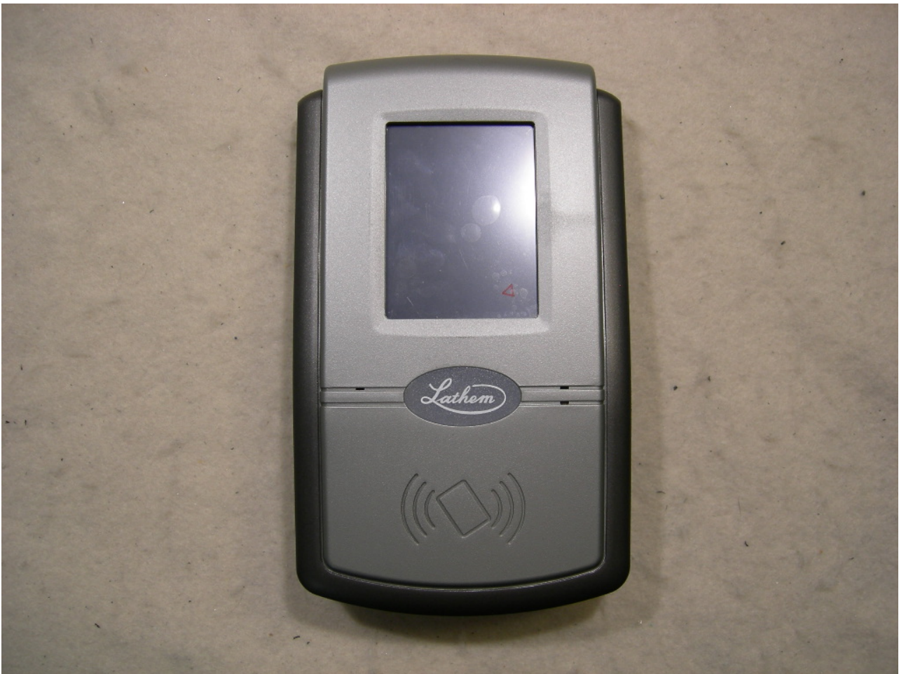
Figure 1: Front view