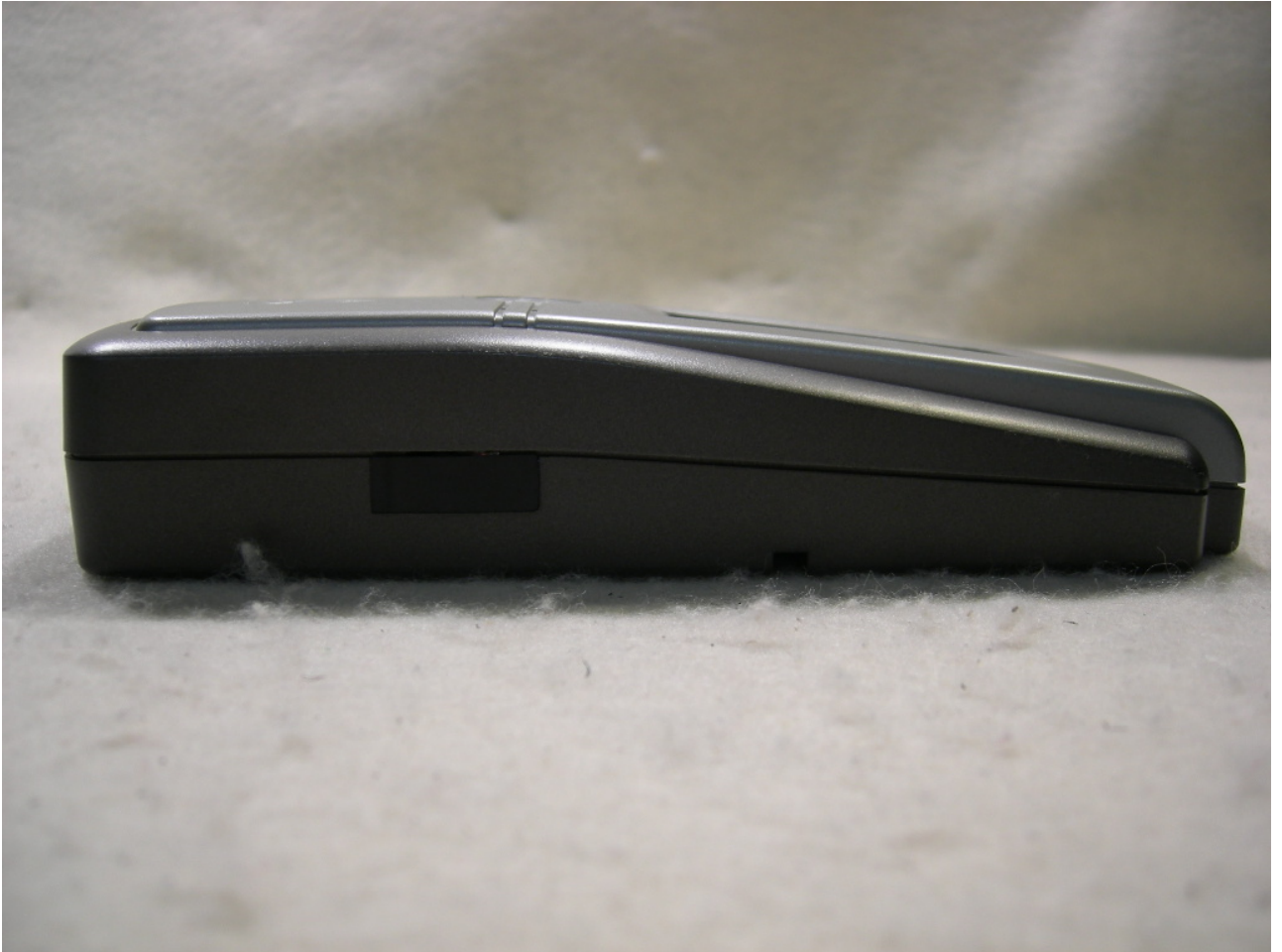
Figure 5: Side View