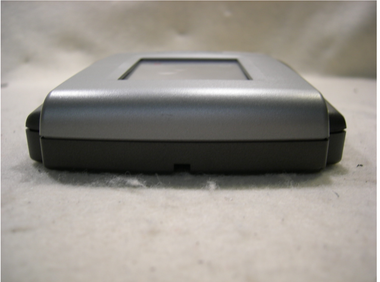
Figure 3: Top View