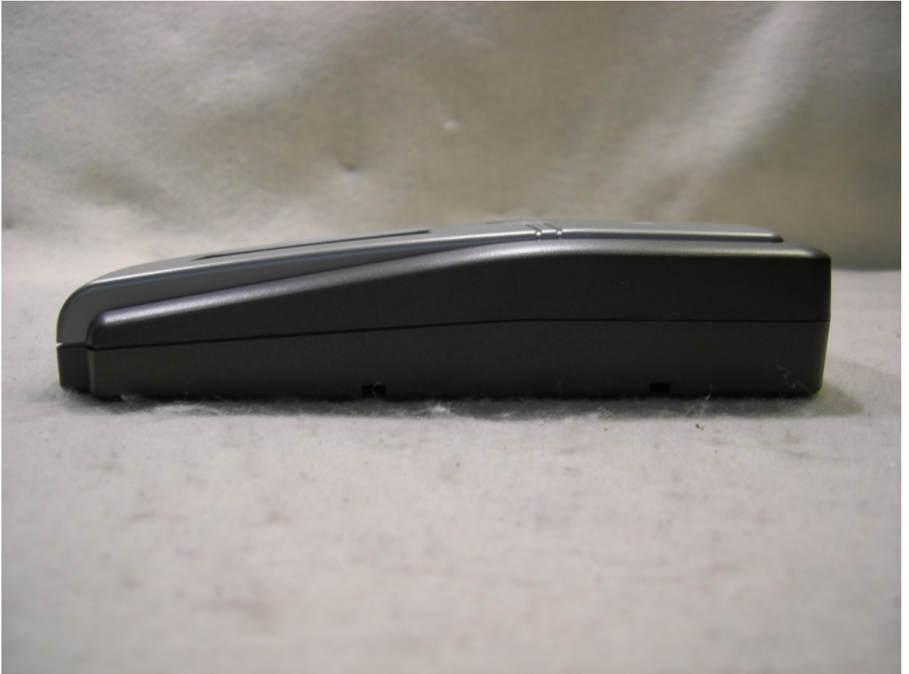
Figure 6: Side 2 View