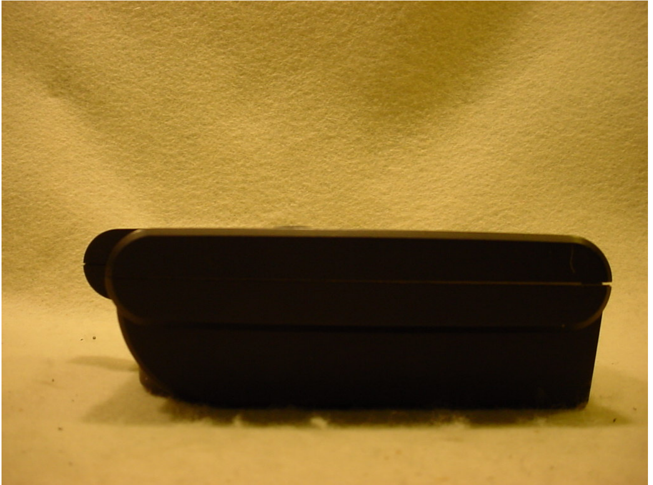
Figure 4: Side 2 View