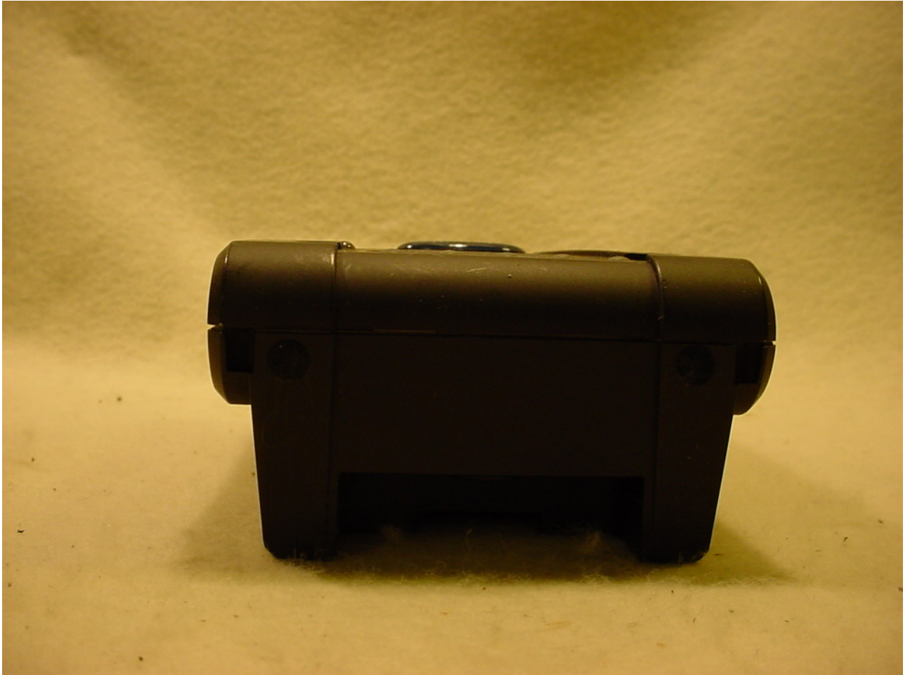
Figure 6: Bottom View