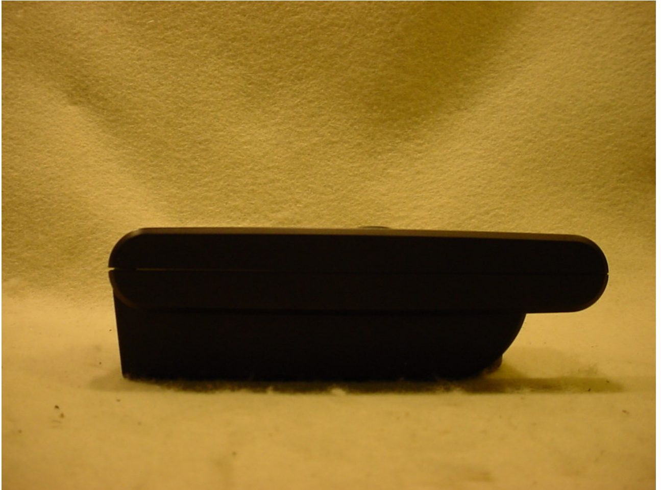
Figure 3: Side 1 View