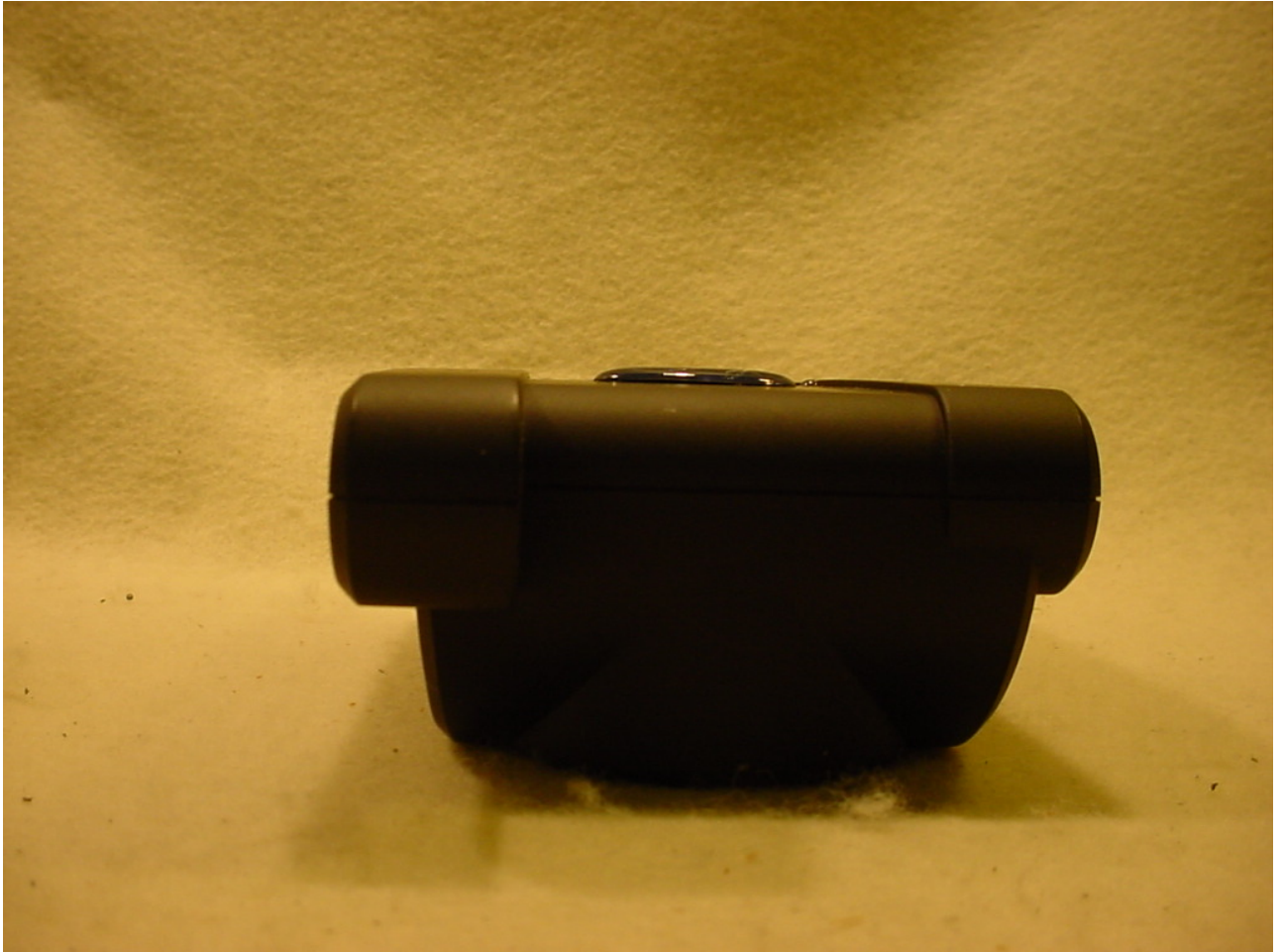
Figure 5: Top View