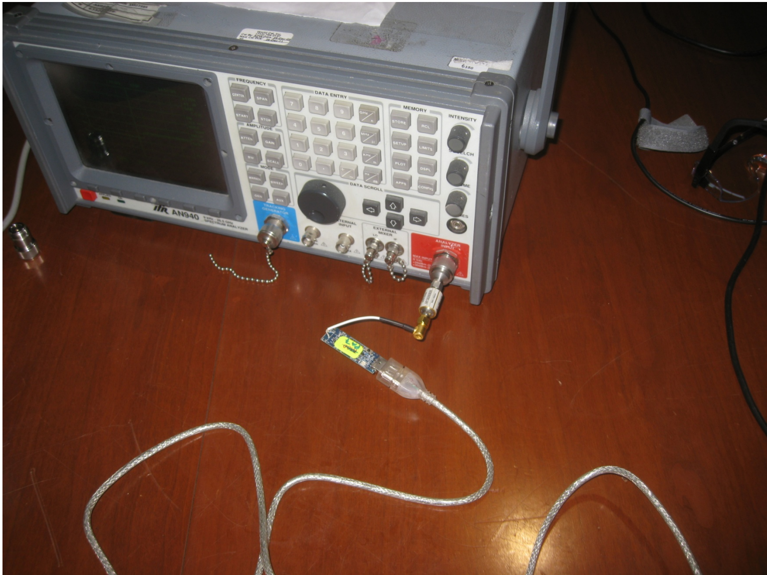
Antenna Conducted Emissions