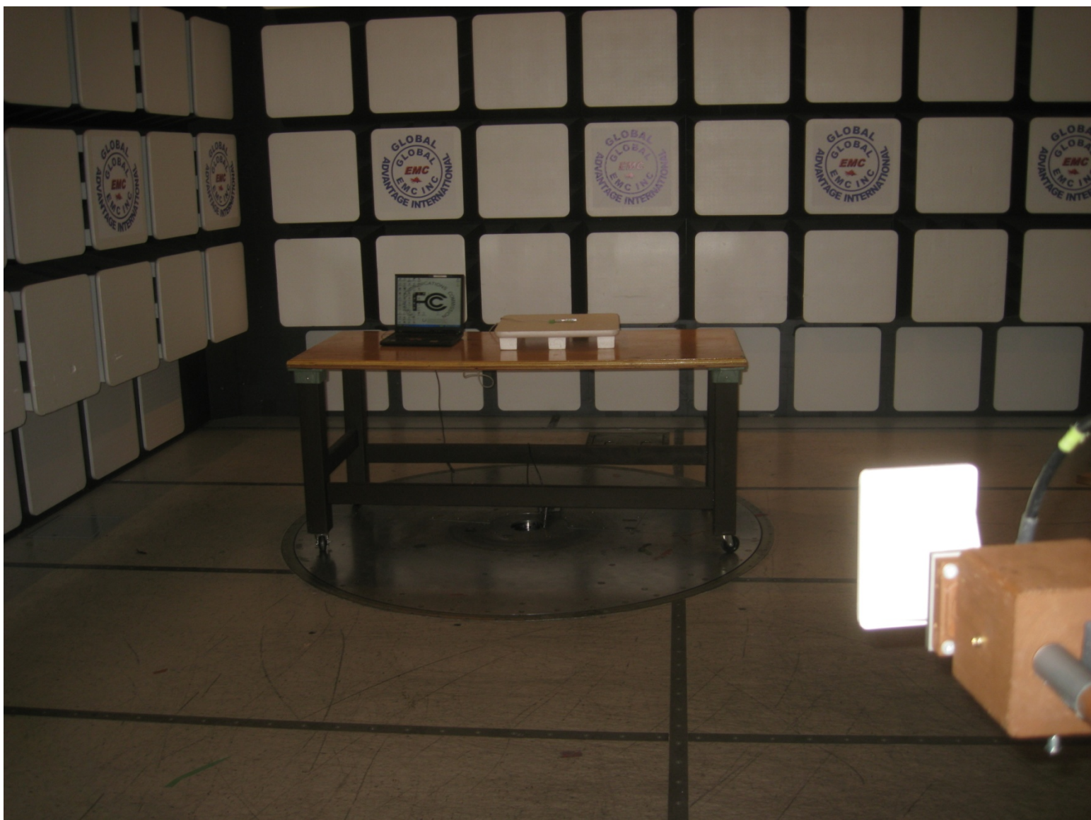
Radiated Emissions – 1.5 GHz to 10 GHz