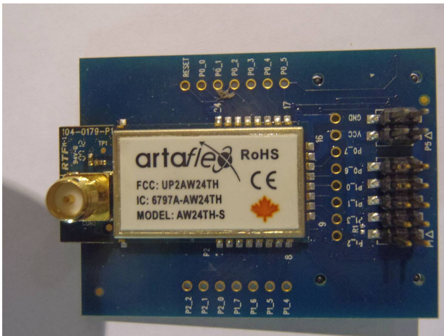
Note: Top view – Reverse Polarity SMA version shown mounted on host card.