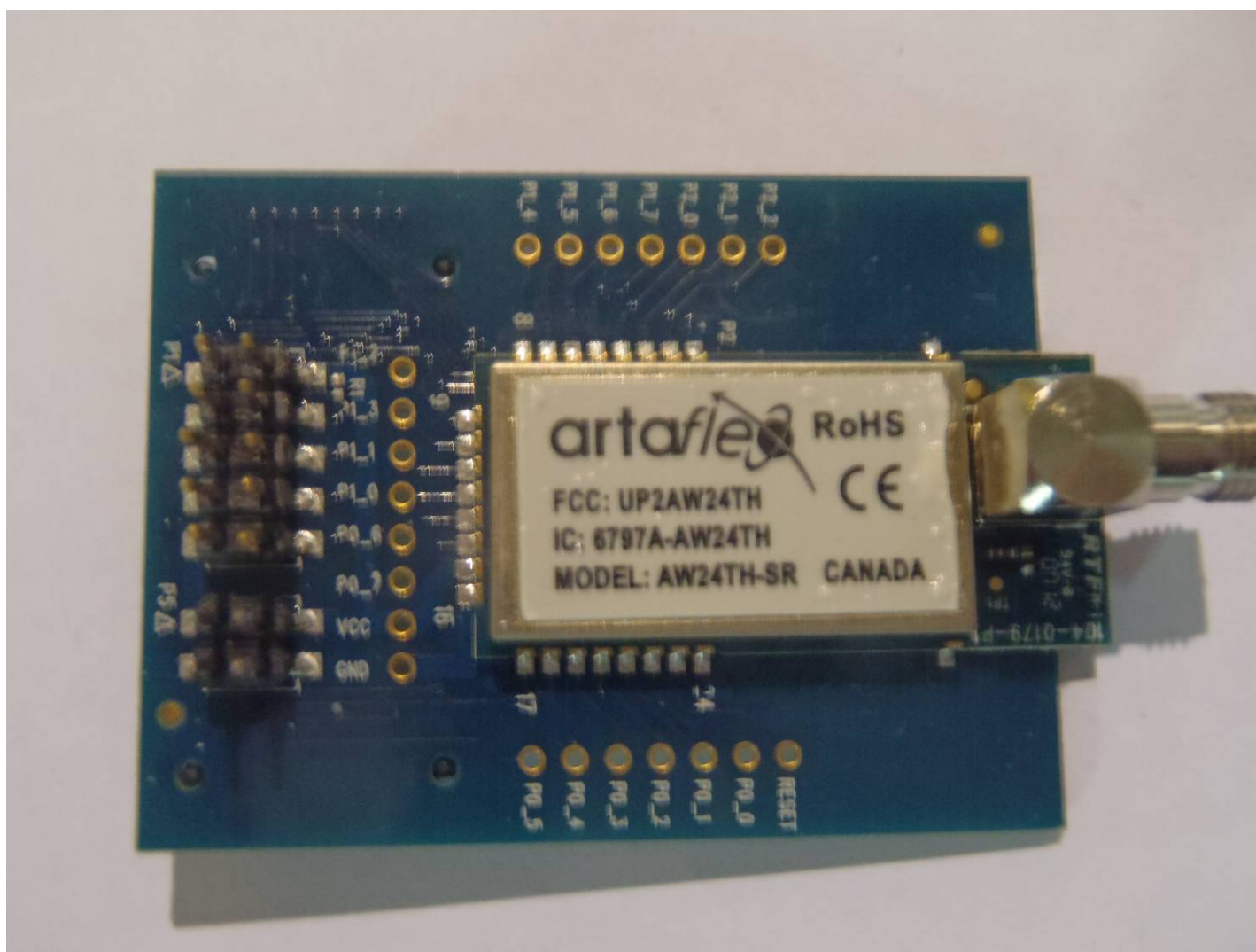
Note: Top view – Right Angle Reverse Polarity SMA version shown mounted on host card.