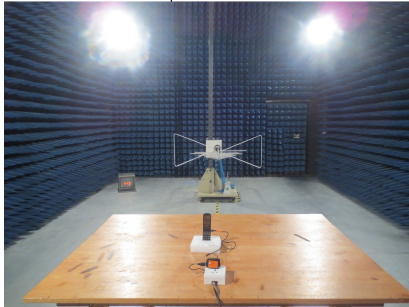
Radiated Spurious Emission