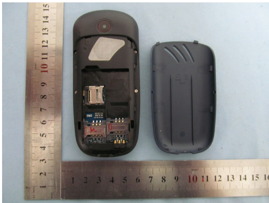
OPEN VIEW OF SAMPLE-2