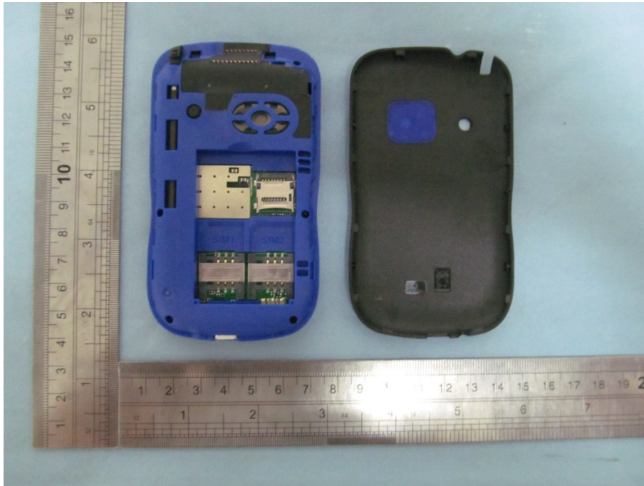
OPEN VIEW OF SAMPLE-1