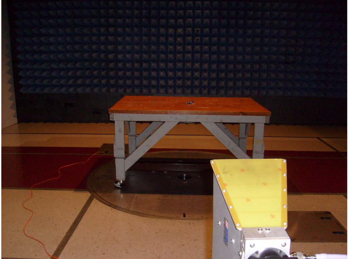
Photograph 4. Test Equipment and setup for various Radiated Measurements