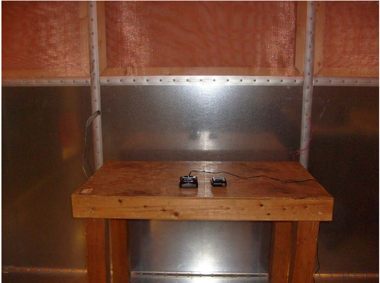
Photograph 2. Conducted Emissions Test Setup