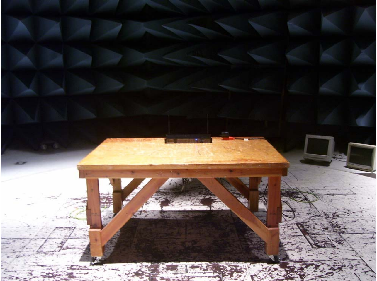
Radiated Emission Test Setup 30 MHz - 1 GHz (Receiver)