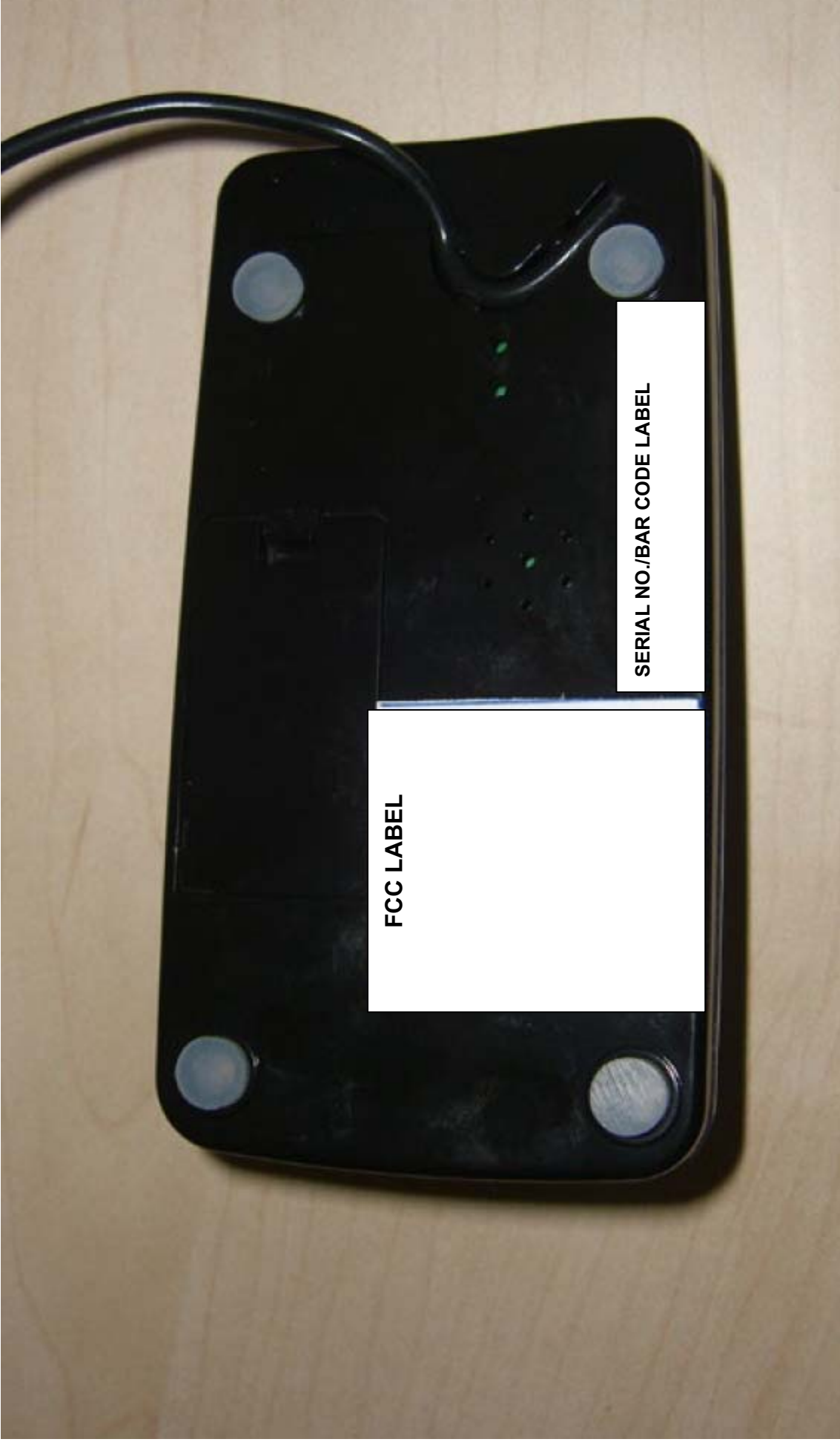
FCC LABEL: 34.925mm Length * 31.75mm Width Serial No./Bar Code Label: 30mm Length * 6mm Width