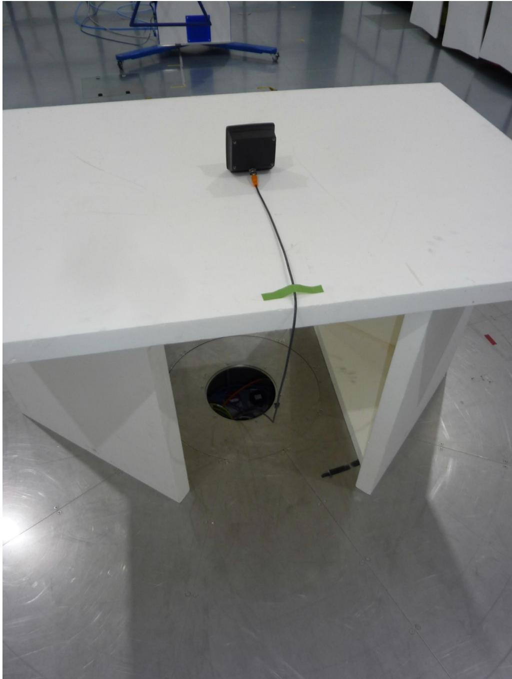
Test setup semi anechoic chamber