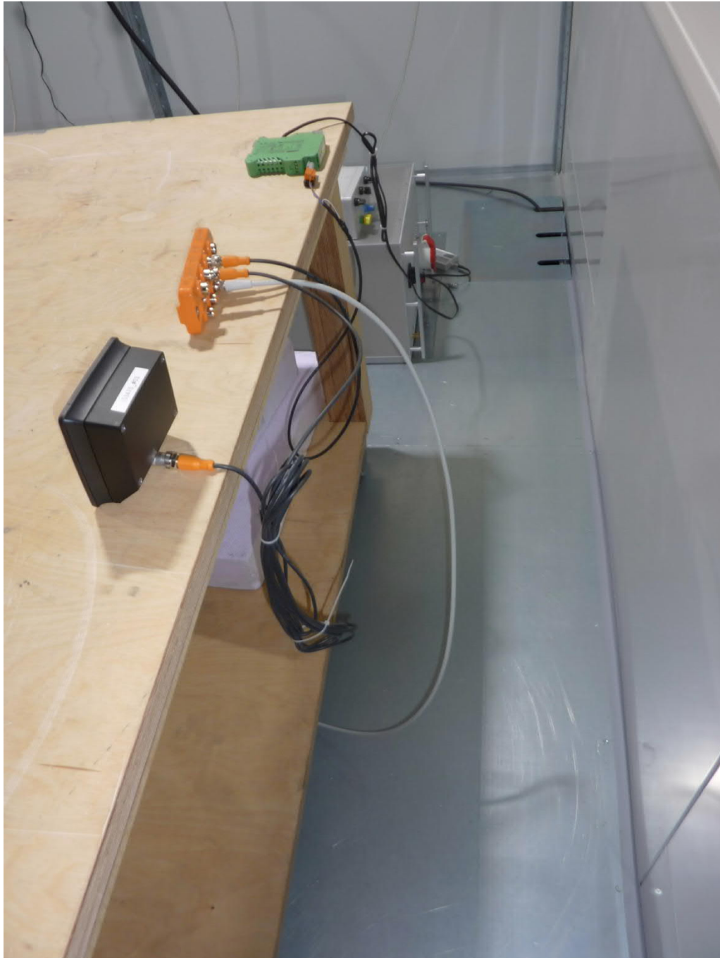
Test setup shielded chamber