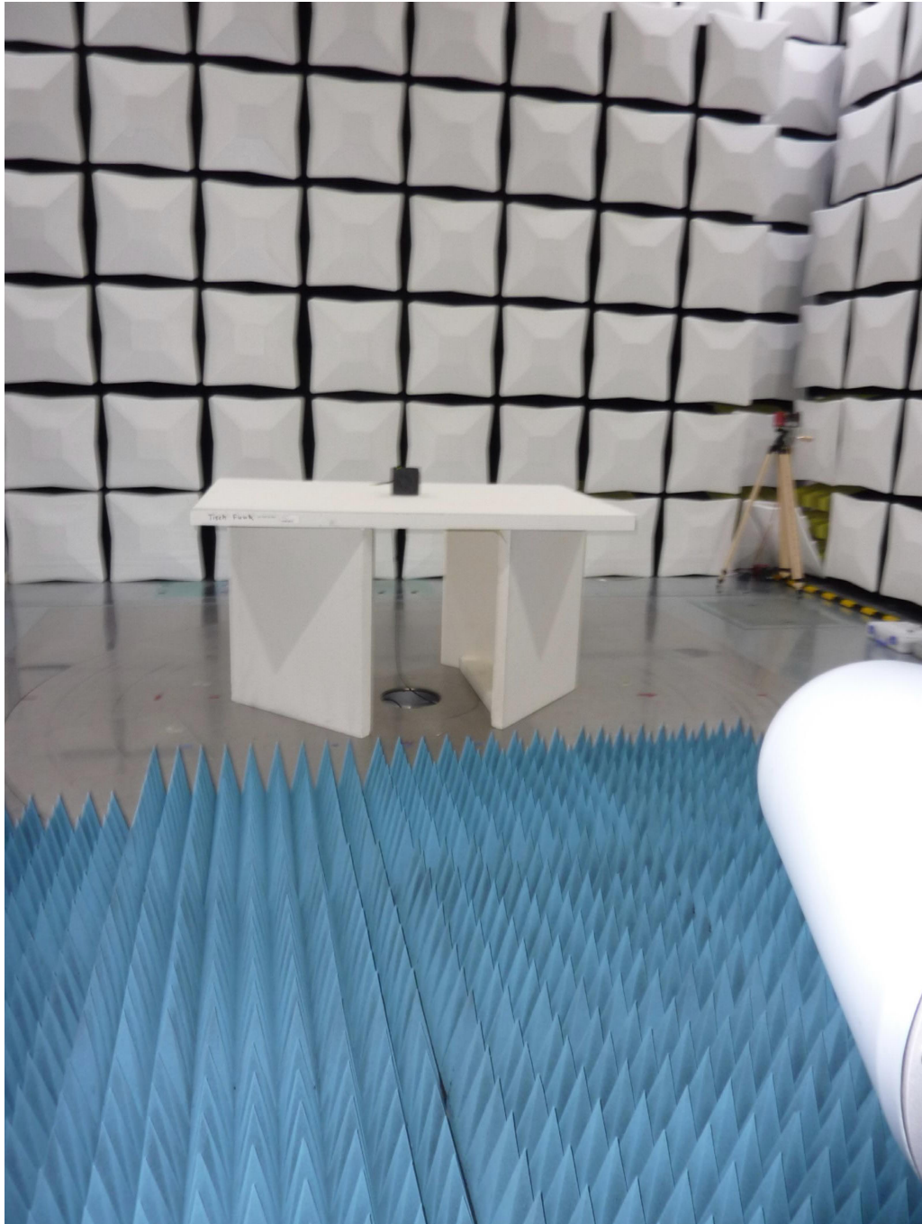
Test setup semi anechoic chamber, measurement from 1 GHz to 5 GHz