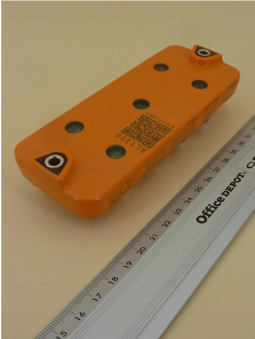
IO-Link Master AL1300, 3-D-view 2