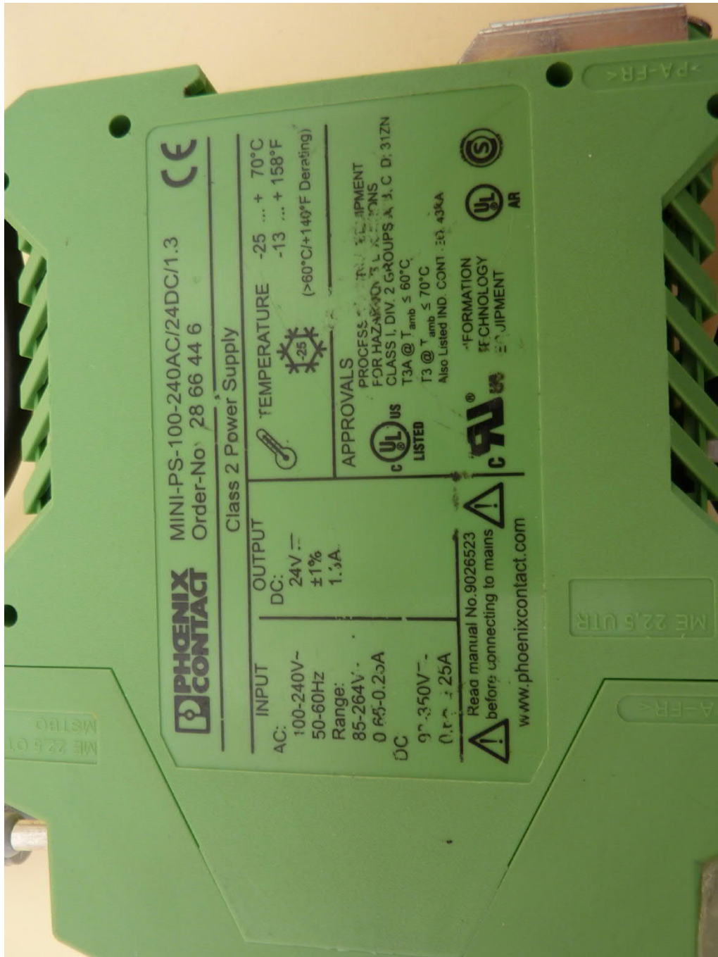
MINI-PS-100-240AC/24/DC/1.3, type plate view