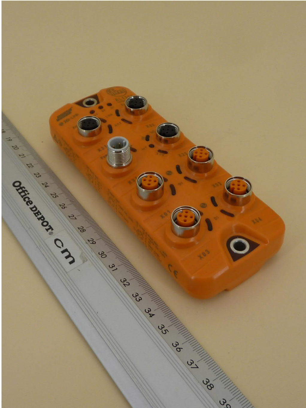
IO-Link Master AL1300, 3-D-view 1