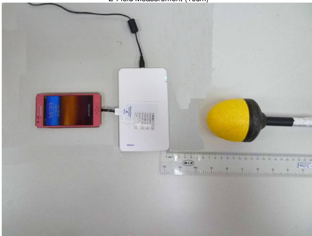
E-Field Measurement (10cm)