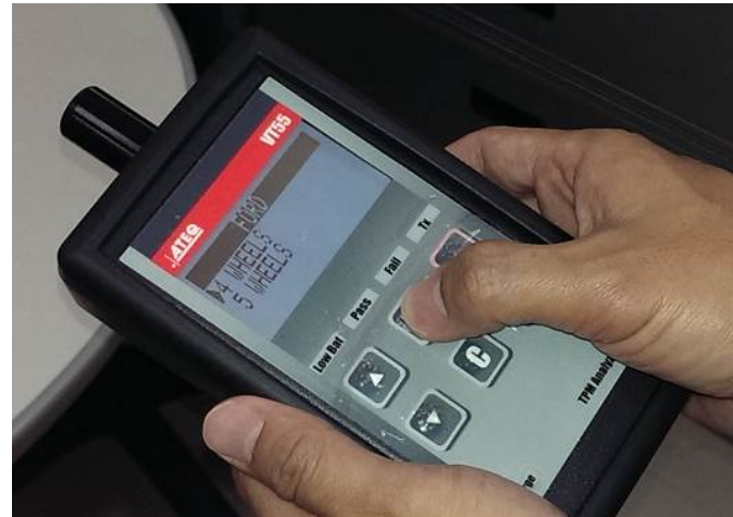
(4)Tire Select (Choose the tire position)