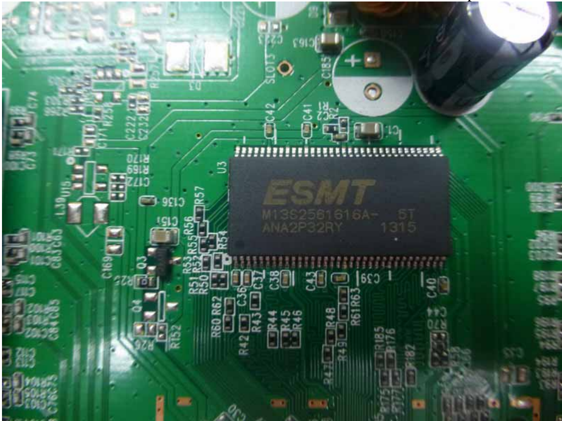
Figure 15 Components Side of the PCB