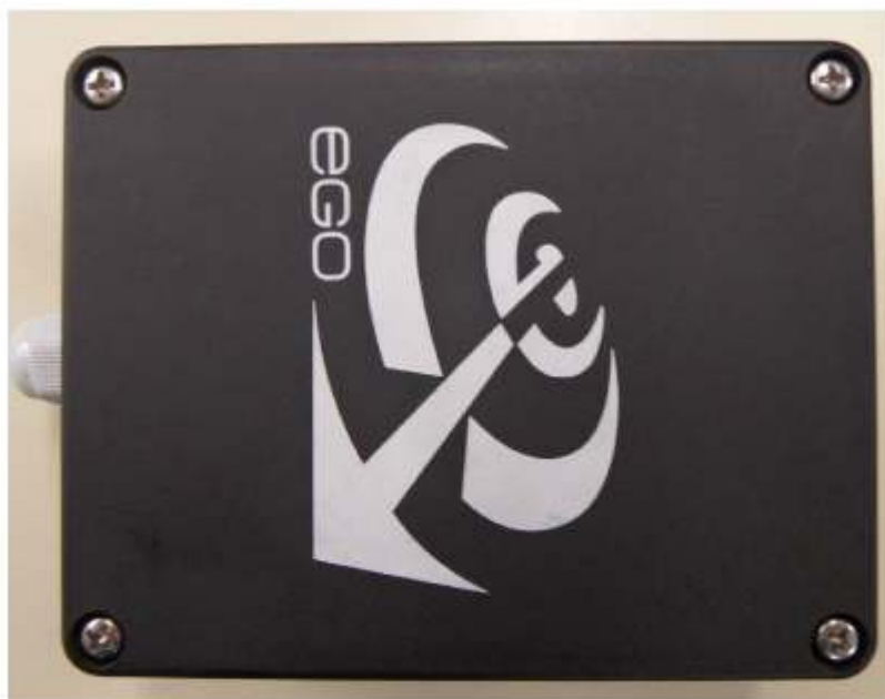
Photo 3 Front Side