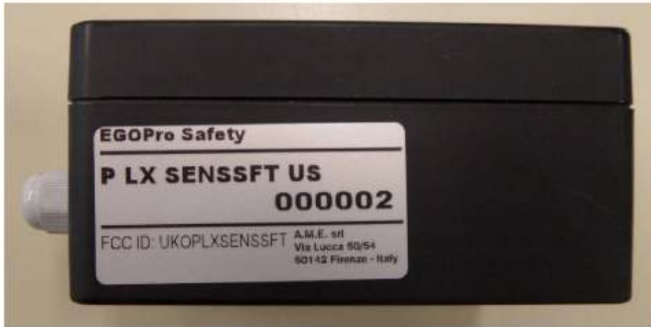
Photo 1 label side