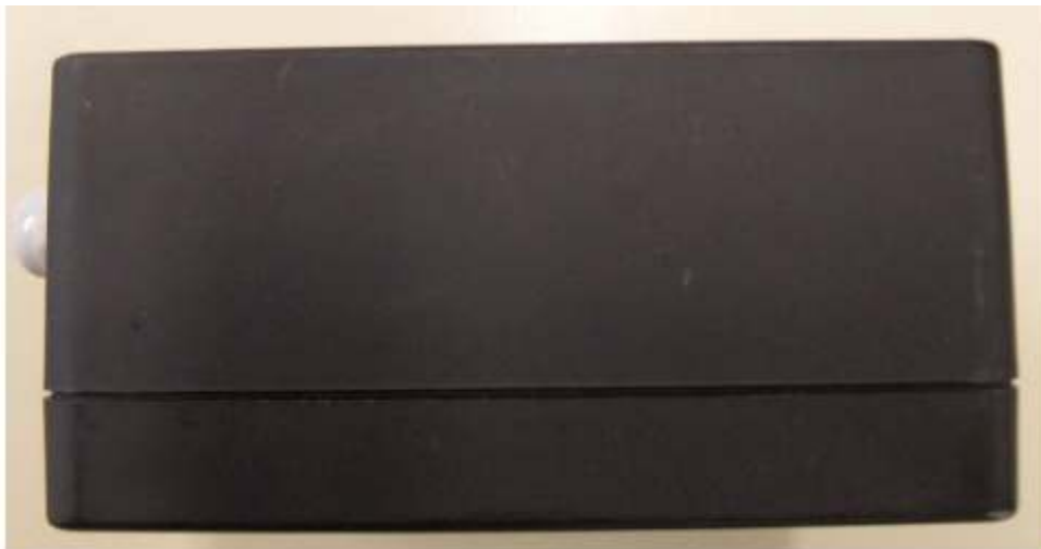
Photo 2 posite of label side