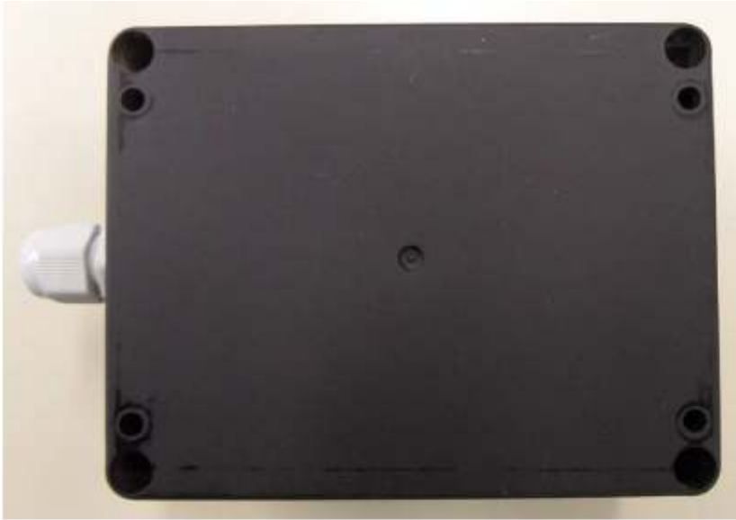
Photo 4 Rear side