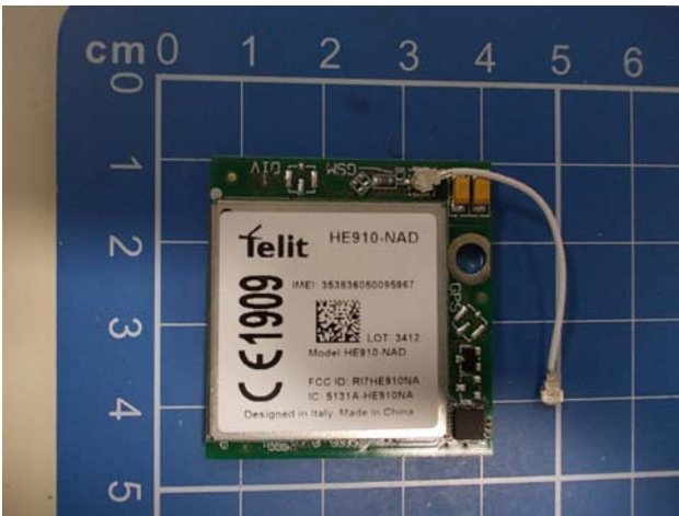
Telit GSM module top side