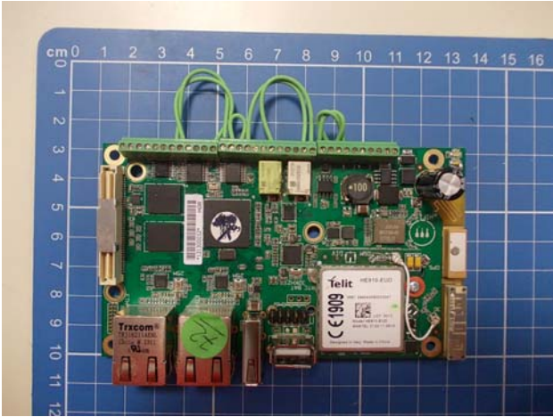
Main board top side