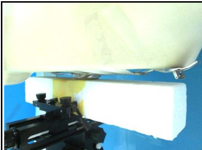
Rear Face of EUT at 0 mm