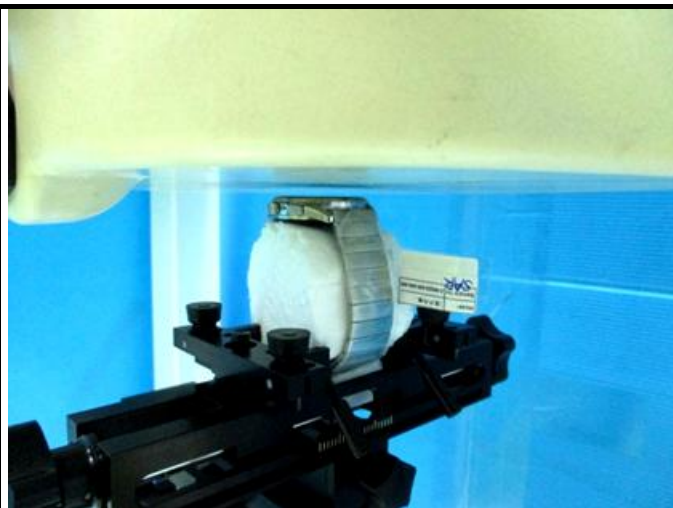
Front Face of EUT at 10 mm