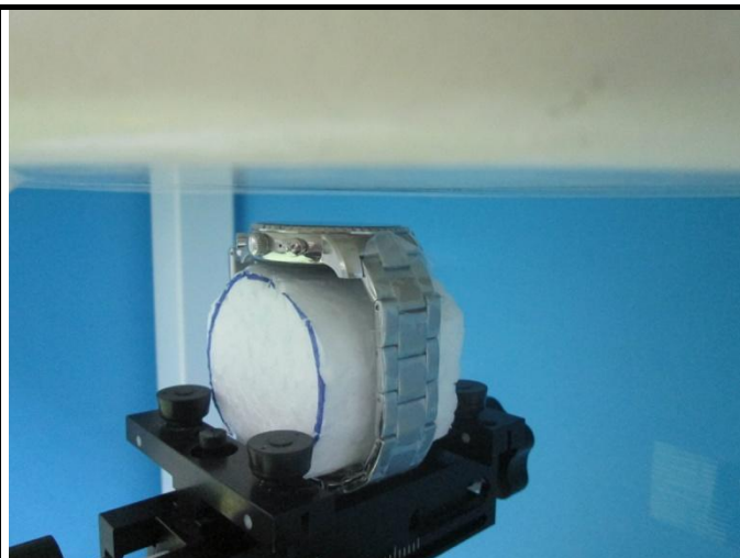
Front Face of EUT at 10 mm