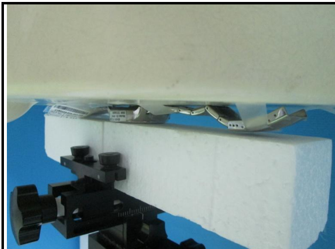
Rear Face of EUT at 0 mm