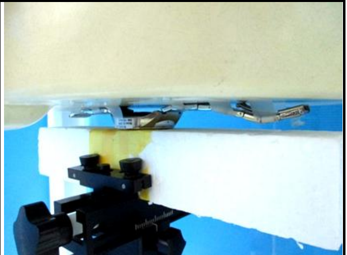
Rear Face of EUT at 0 mm