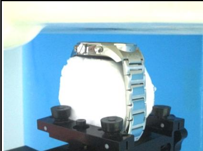
Front Face of EUT at 10 mm