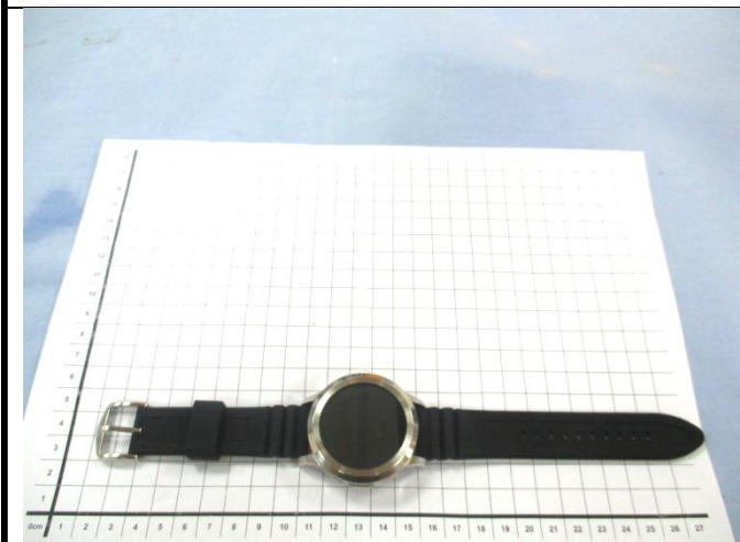
EUT 2 – Front View