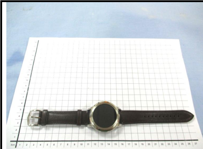
EUT 1 – Front View