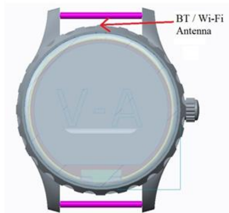
<EUT Front View>

The separation distance for antenna to edge: