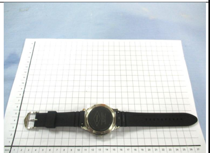
EUT 2 – Rear View