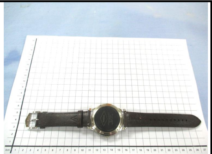
EUT 1 – Rear View