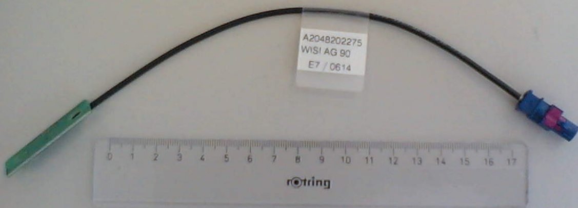
Top View of the Pattern Antenna