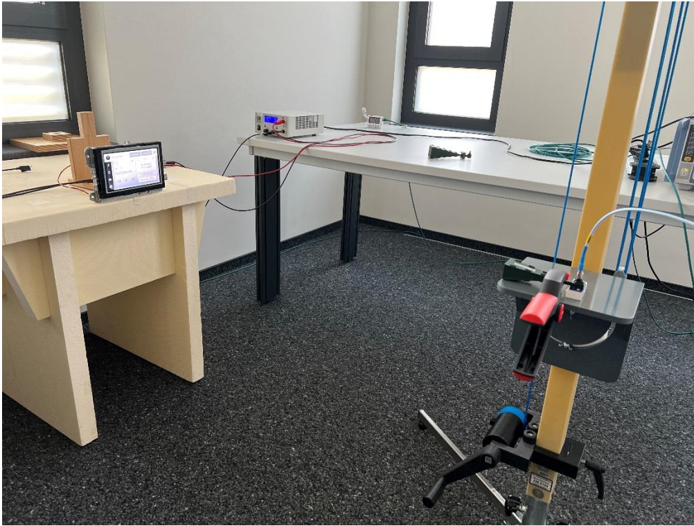
Photograph 9: Radiated emission 18...40 GHz