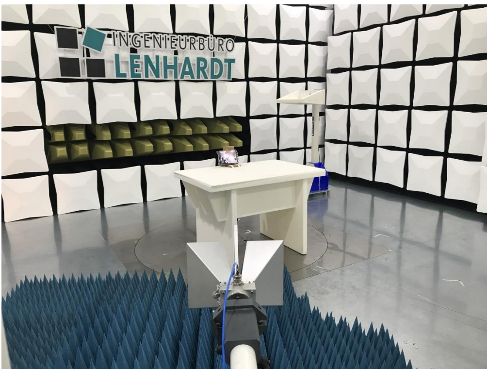
Photograph 8: Radiated emission 1...18 GHz