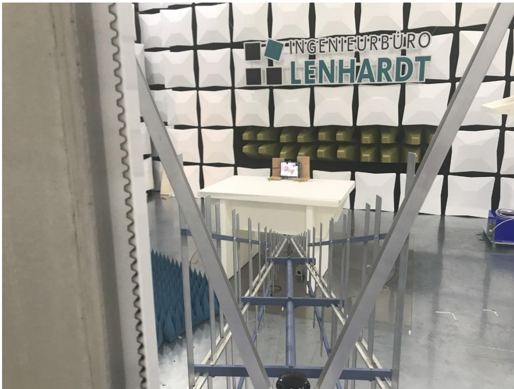
Photograph 4: Radiated emission 30...1000 MHz