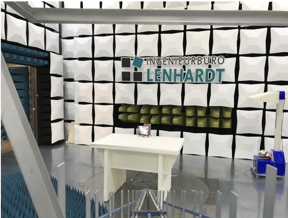
Photograph 7: Radiated emission 30...1000 MHz