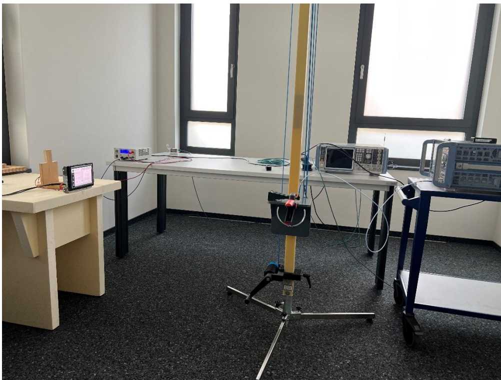
Photograph 3: Radiated emission 18...40 GHz