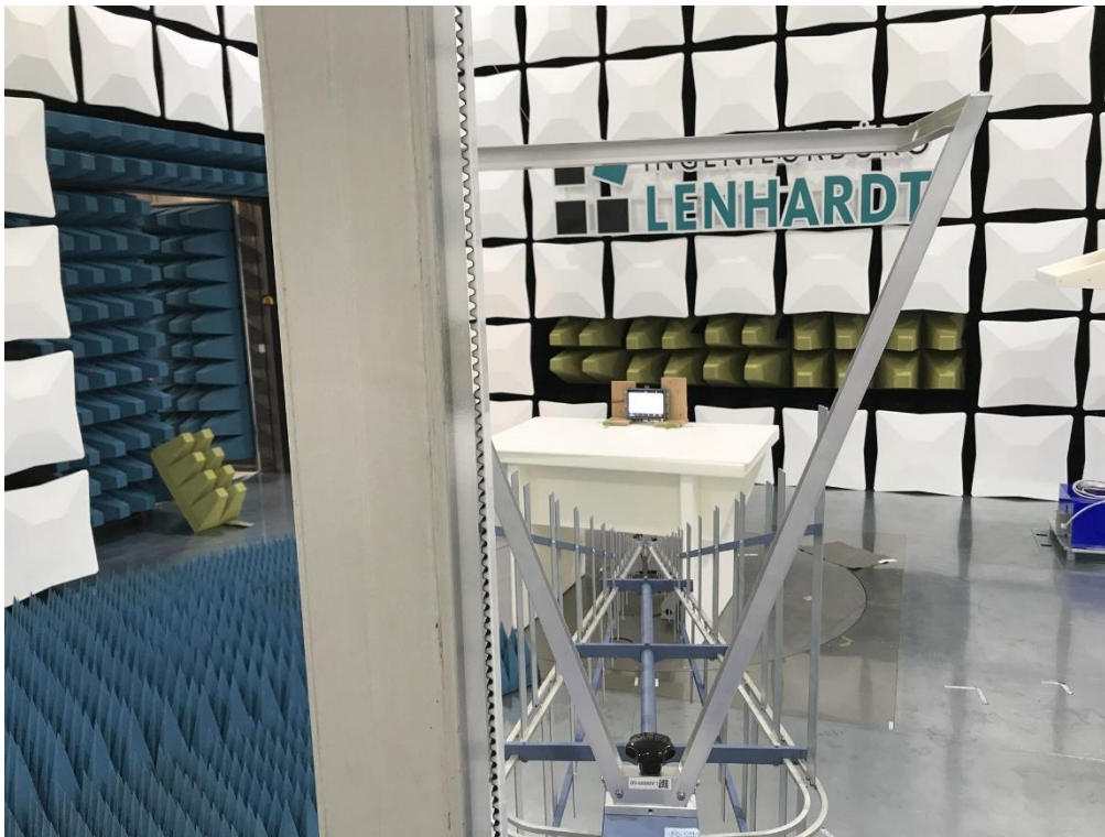
Photograph 1: Radiated emission 30...1000 MHz