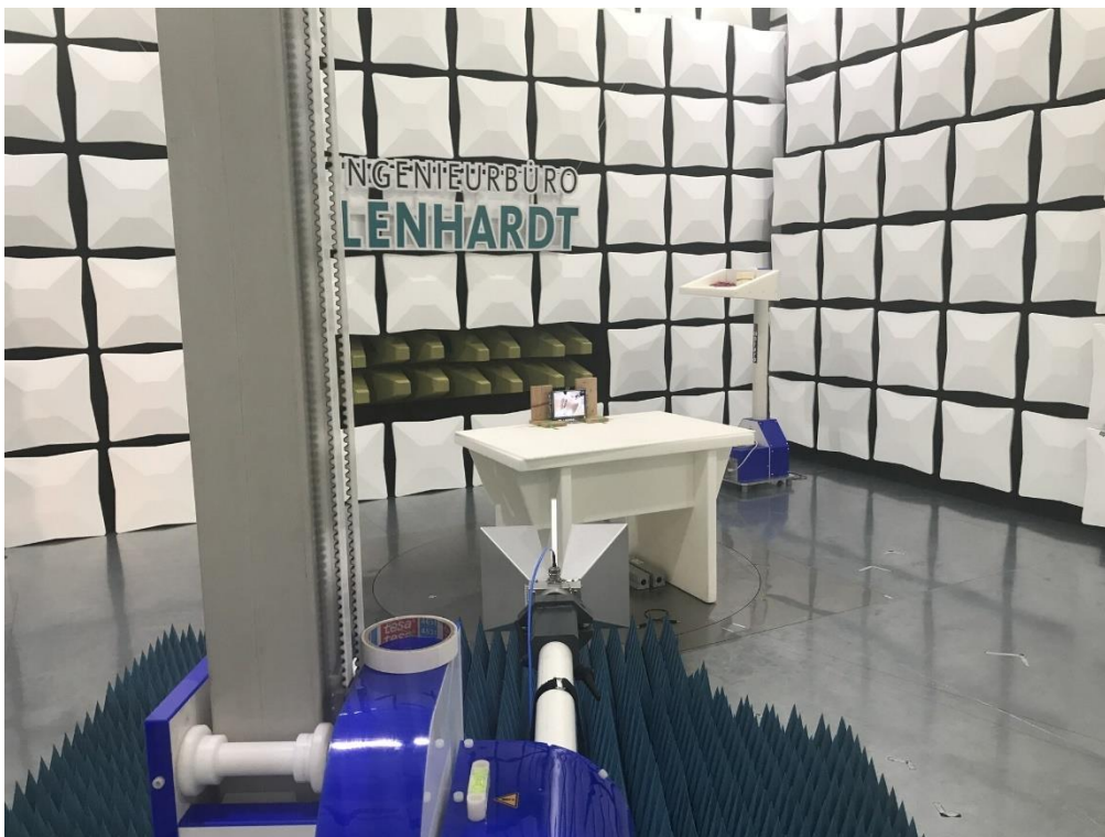
Photograph 5: Radiated emission 1...18 GHz