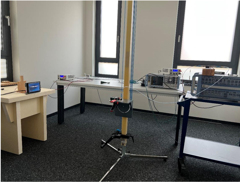
Photograph 6: Radiated emission 18...40 GHz