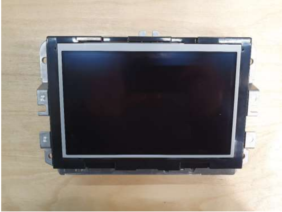
Photograph 5: EUT C