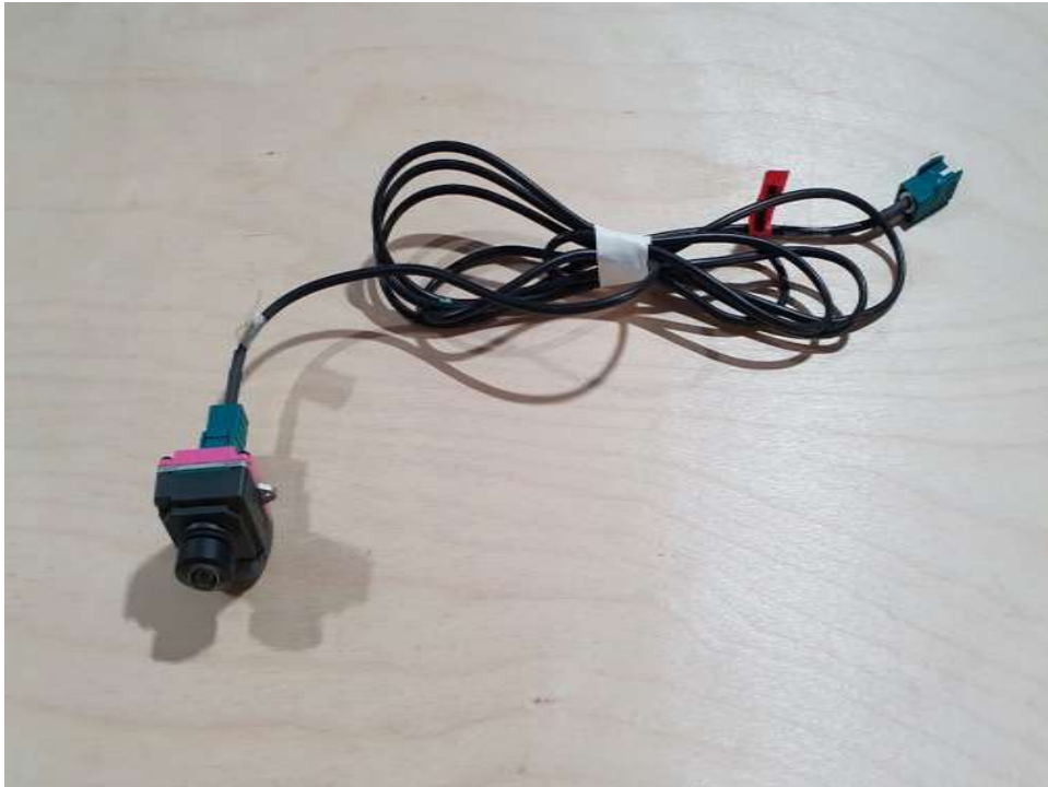
Photograph 9: AE