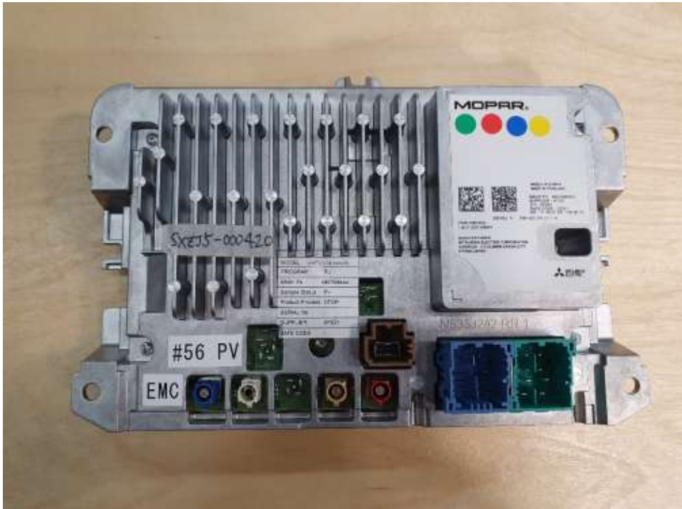
Photograph 6: EUT C