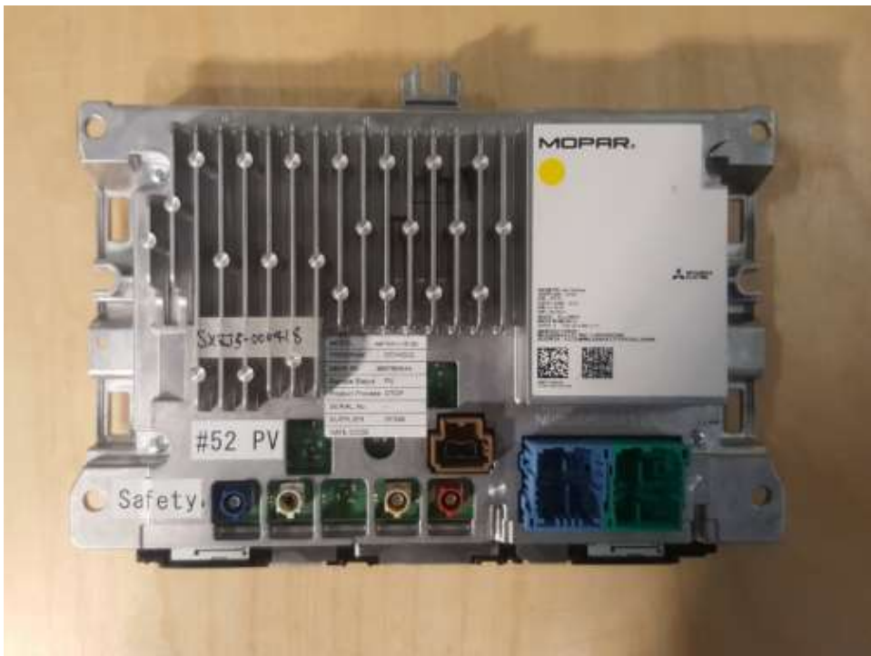
Photograph 4: EUT B