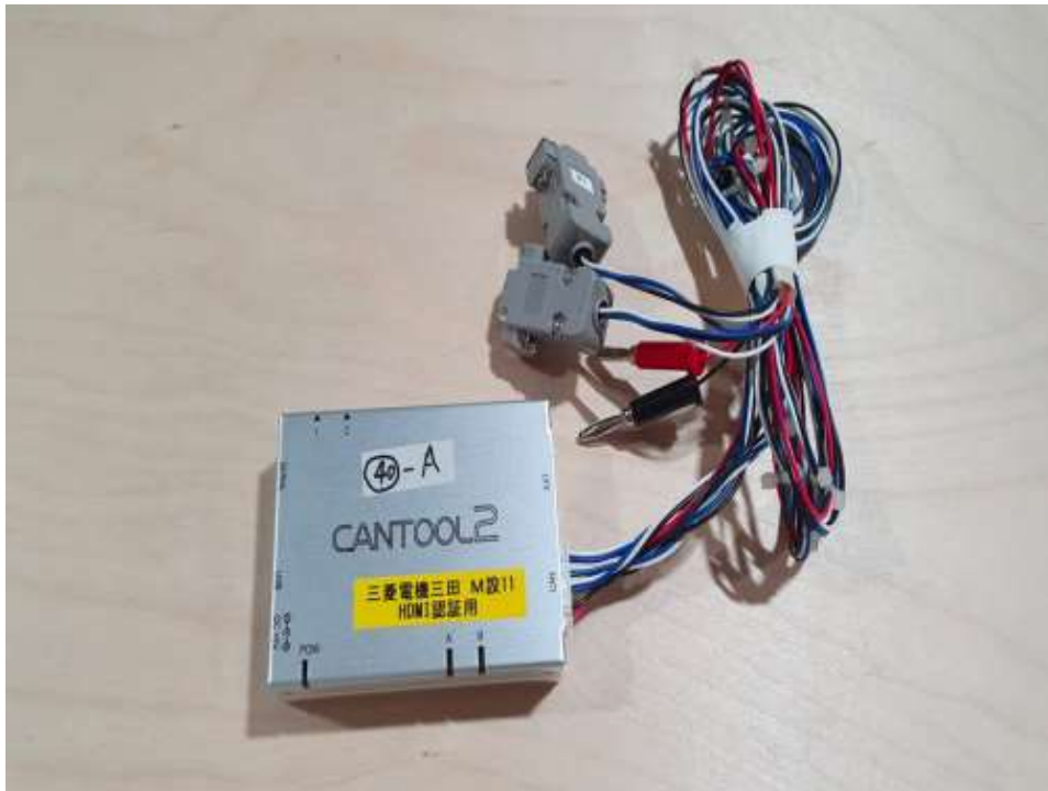
Photograph 11: AE