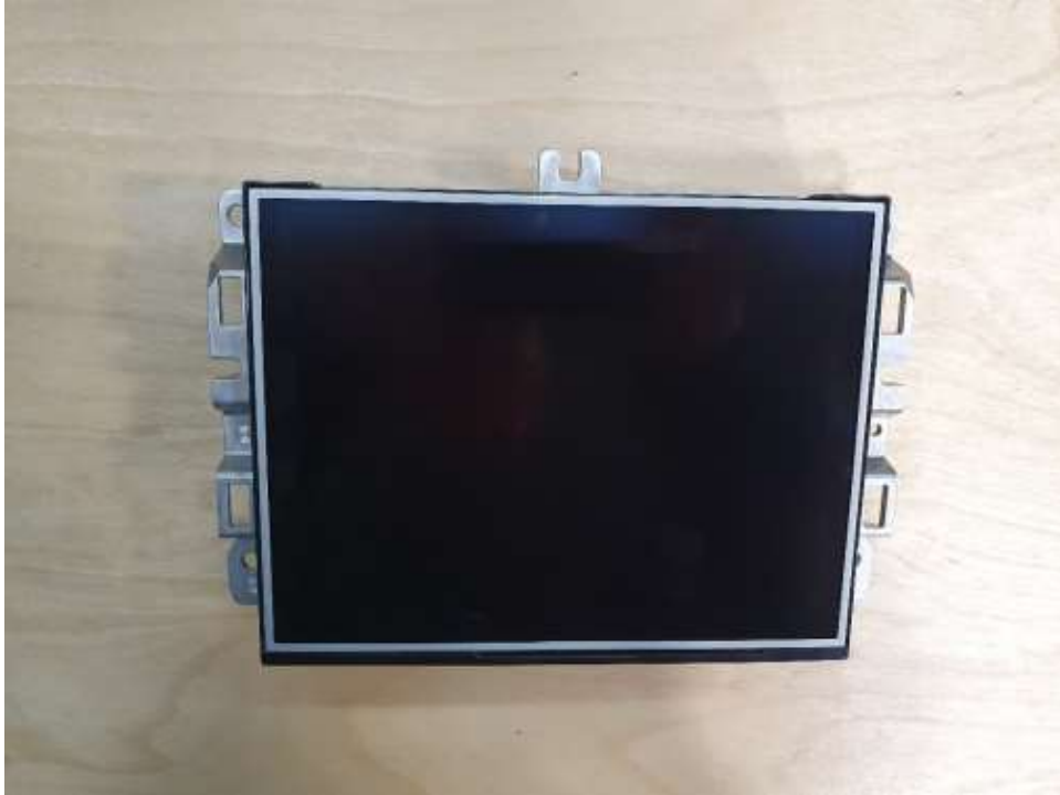
Photograph 1: EUT A