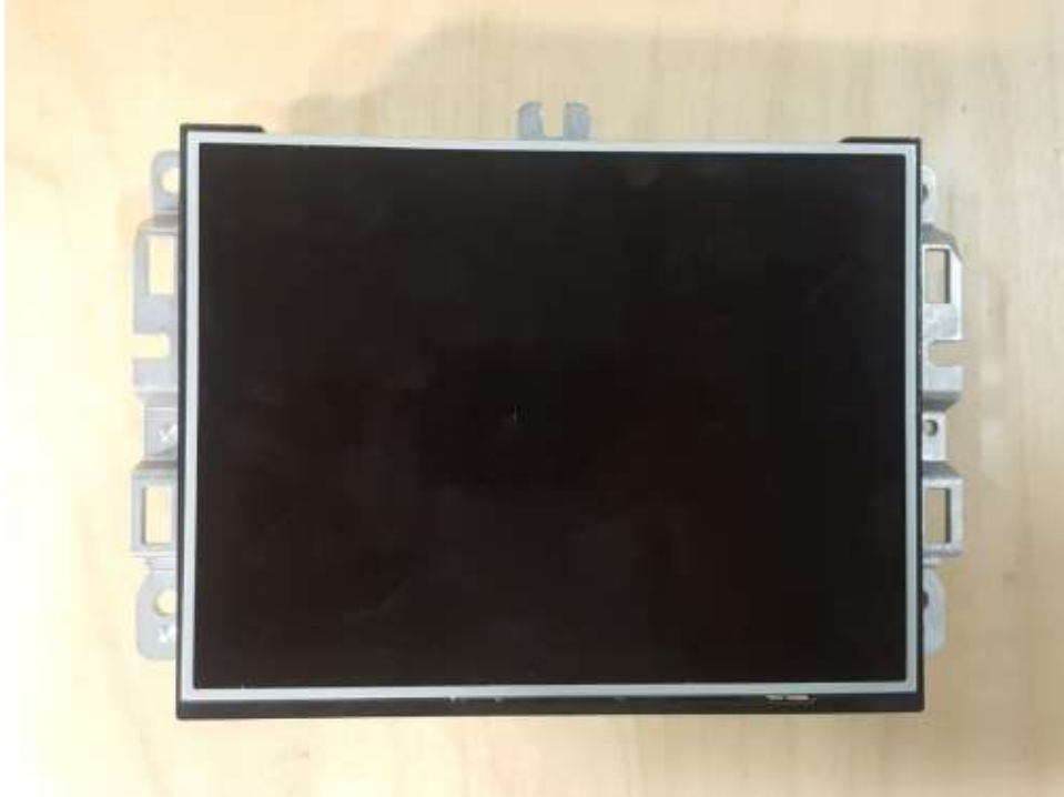
Photograph 3: EUT B