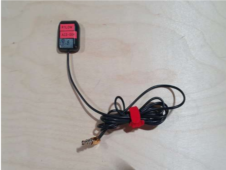
Photograph 7: AE