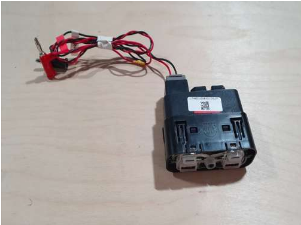
Photograph 10: AE