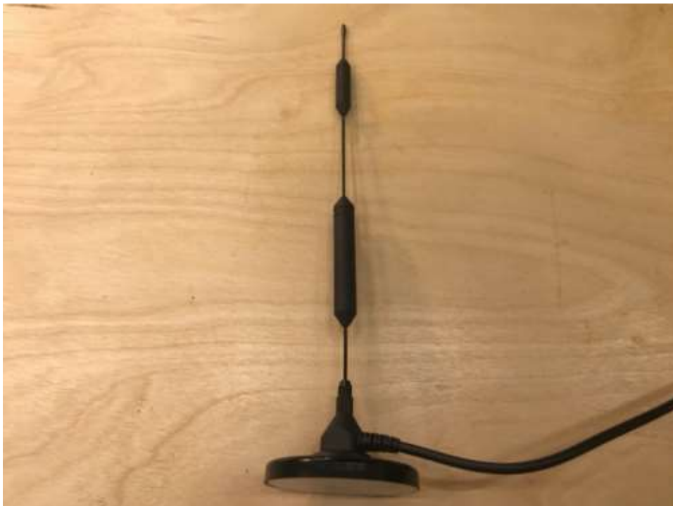
Photograph 8: AE