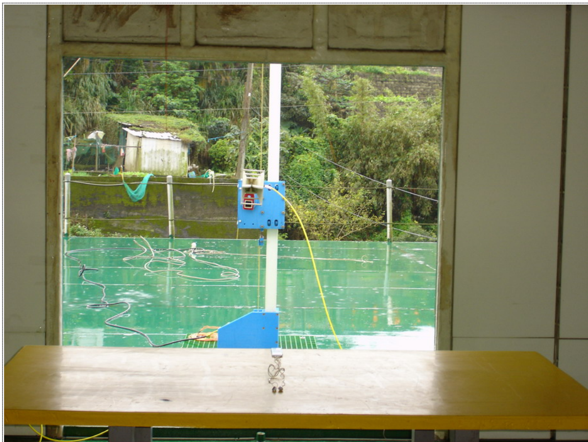
Rear View (Frequency 1-18GHz)