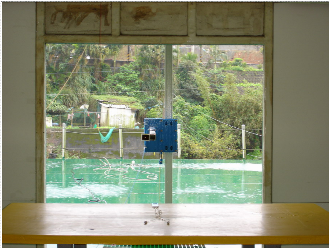
Rear View (Frequency above 18GHz)