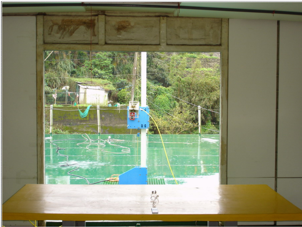
Front View (Frequency 1-18GHz)