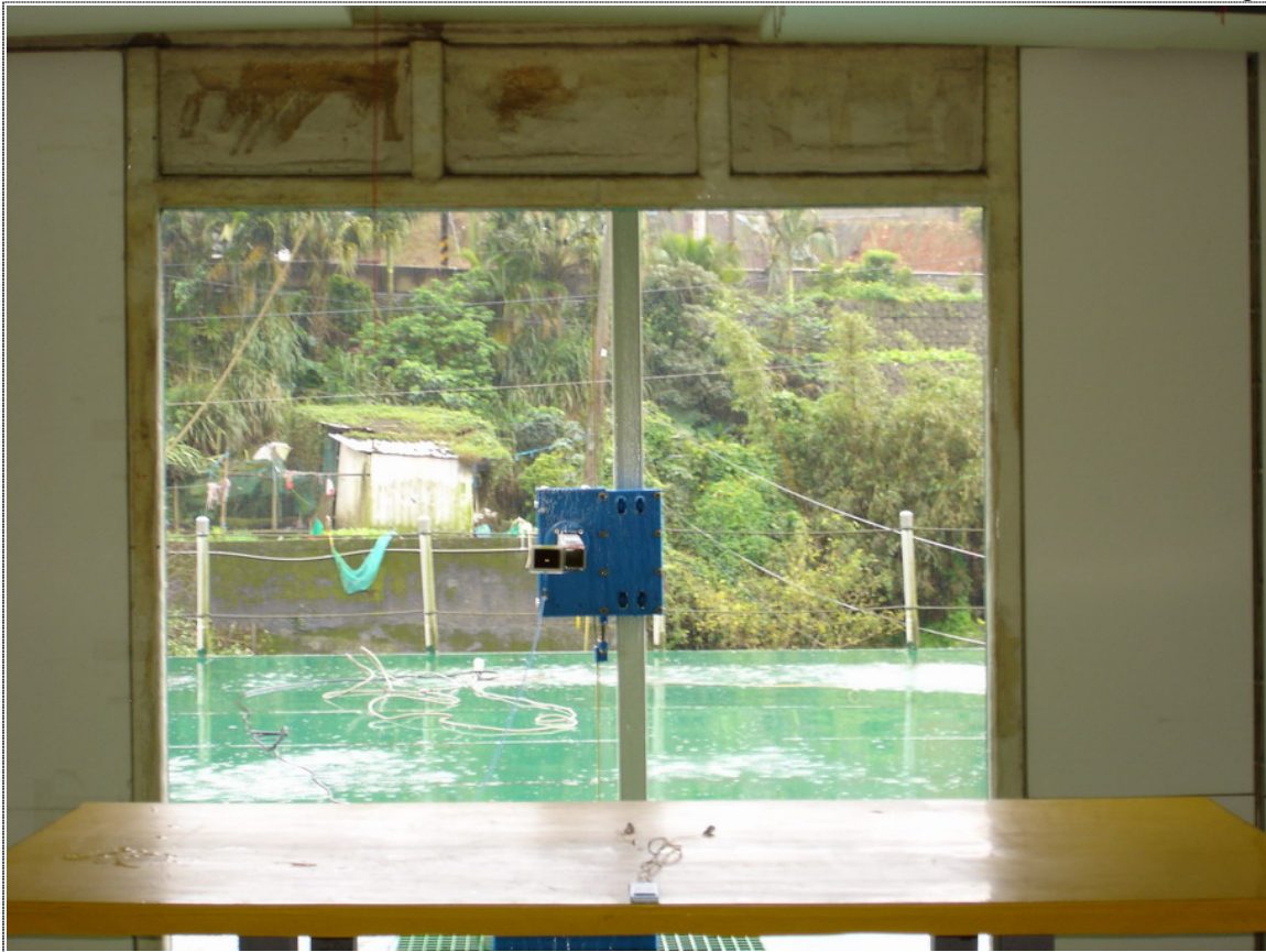
Front View (Frequency above 18GHz)