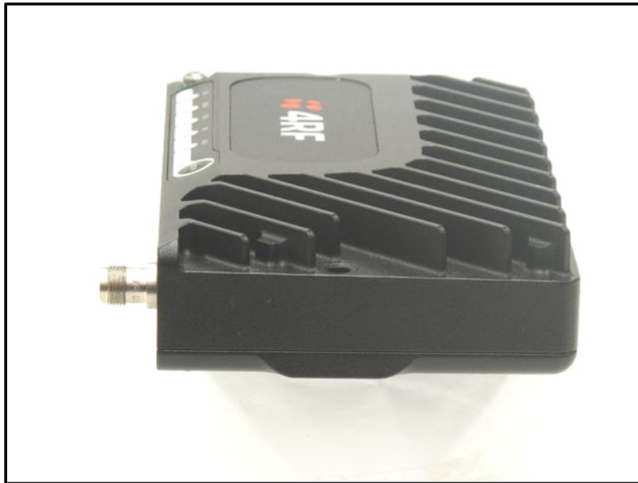
Photograph 6: Side