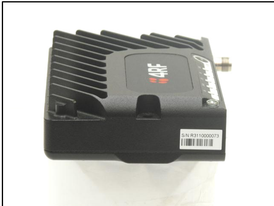
Photograph 7: Side