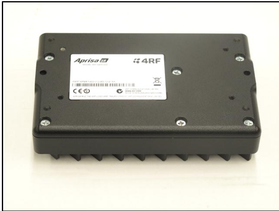
Photograph 8: Bottom