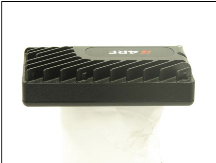
Photograph 5: Back