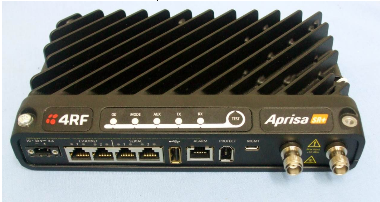
External photos of the device tested