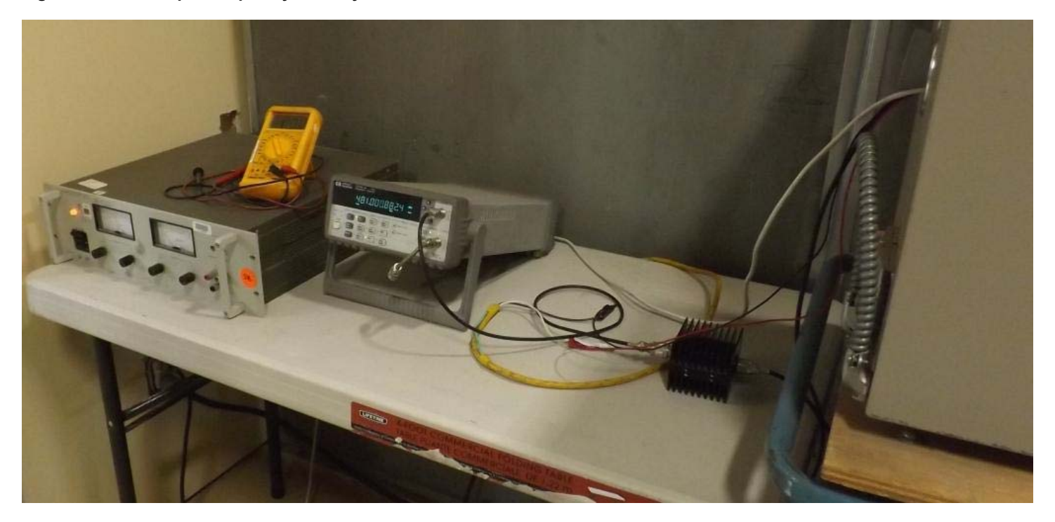
Figure E10.3 – Setup – Frequency Stability