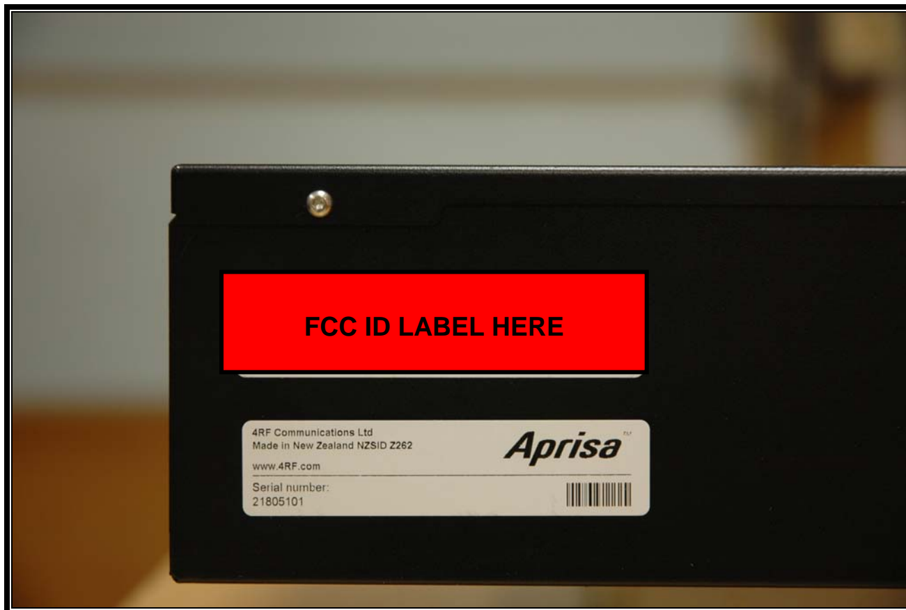
Photograph 1: FCC ID Label Location

Please refer to the following pages for a sample of the FCC ID label and Part 15 label, and the Part 15 label location.