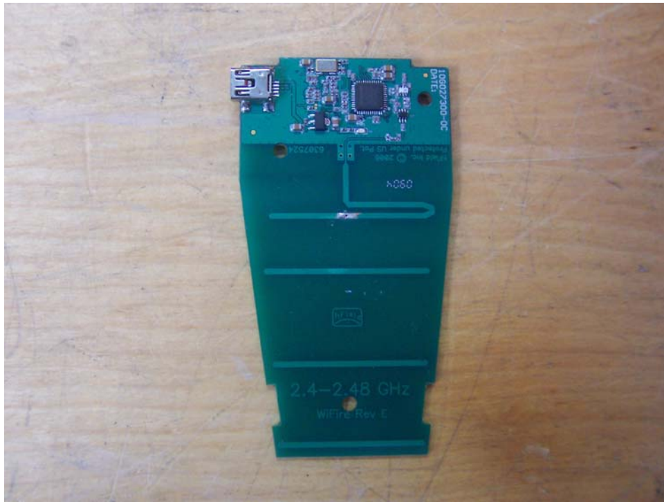
EUT Top View of Circuit Board