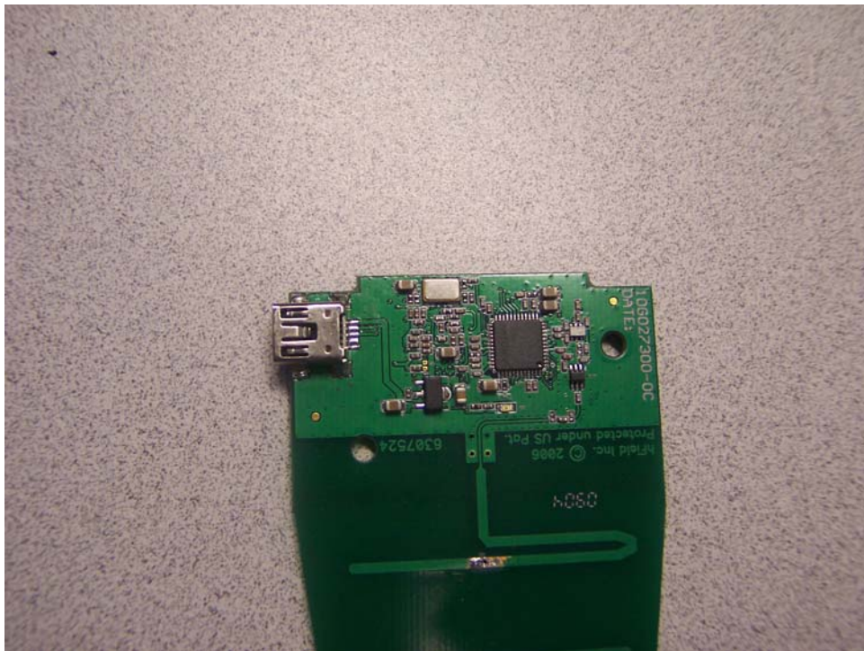
EUT Bottom Side of Circuit Board Closeup