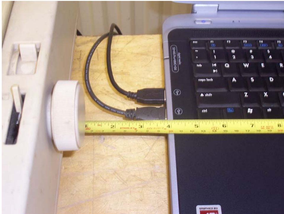
10 cm Spacing