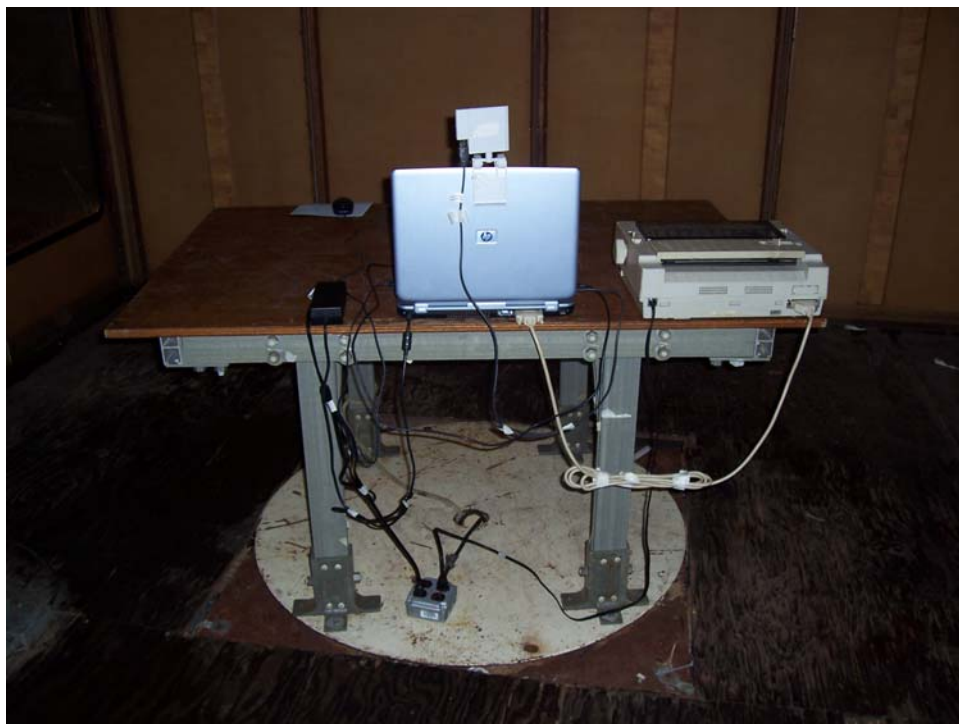
Test Setup, Rear View