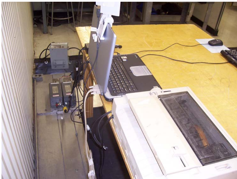
Rear Test Setup