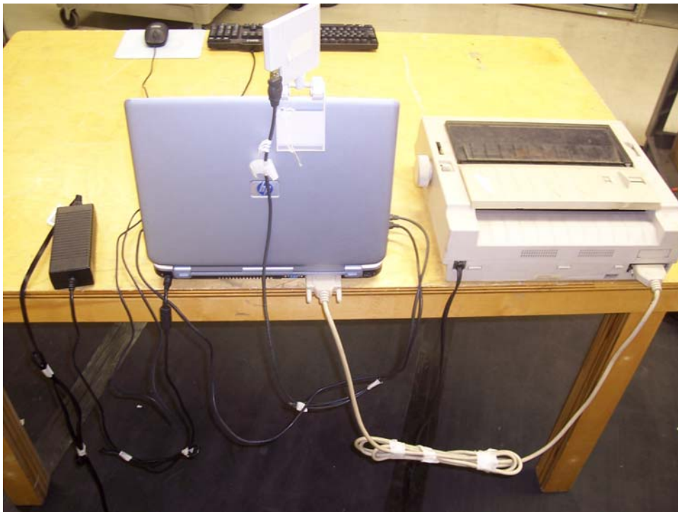
Test Setup, Rear View