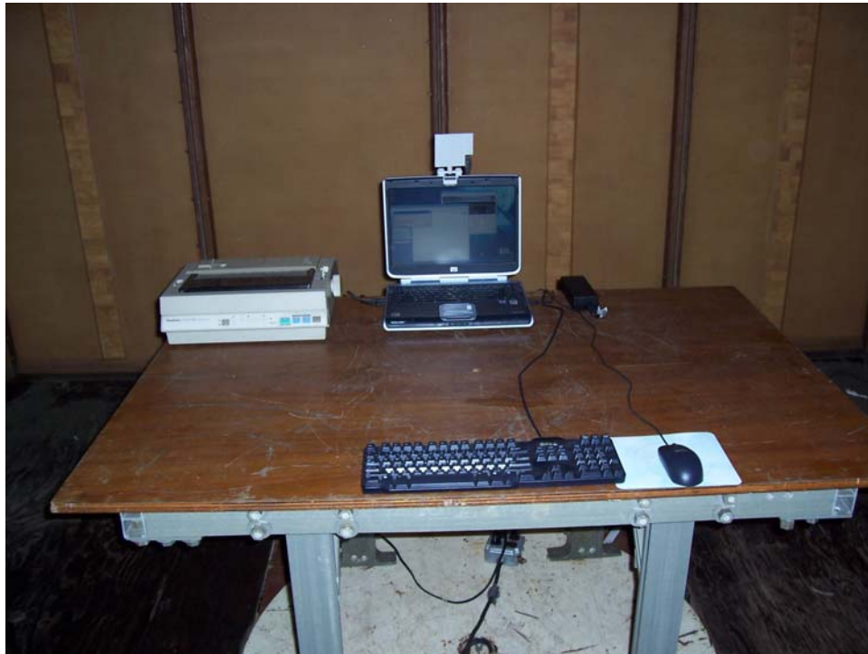
Test Setup, Front View