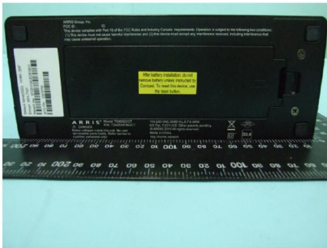
Figure 6: TG862G/CT – Side