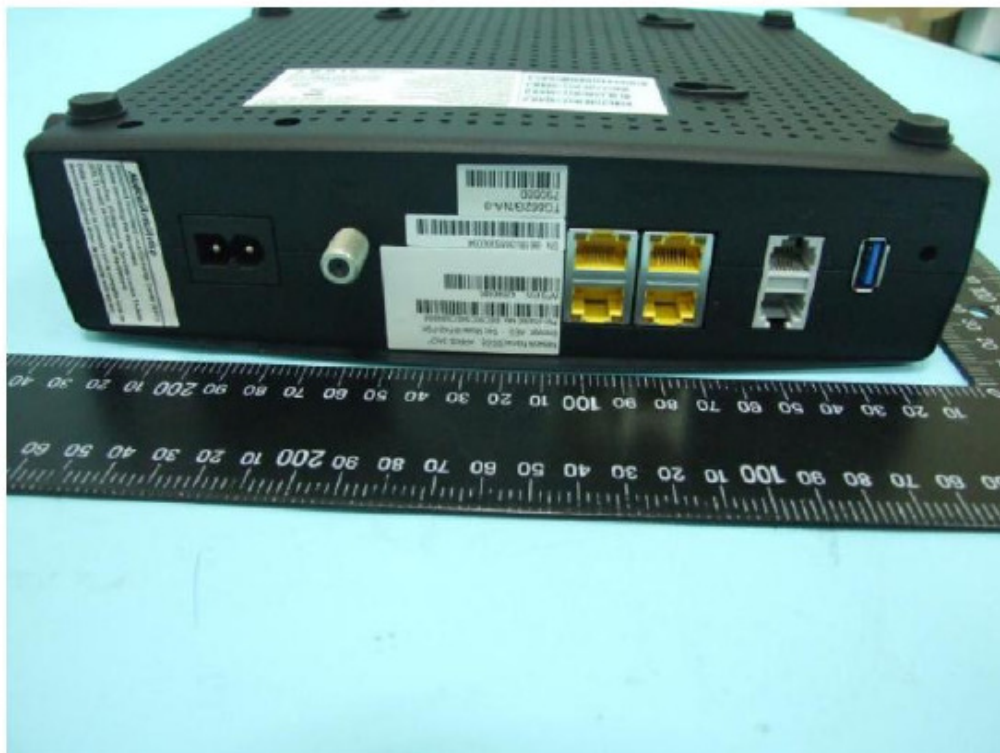
Figure 4: TG862G – Back