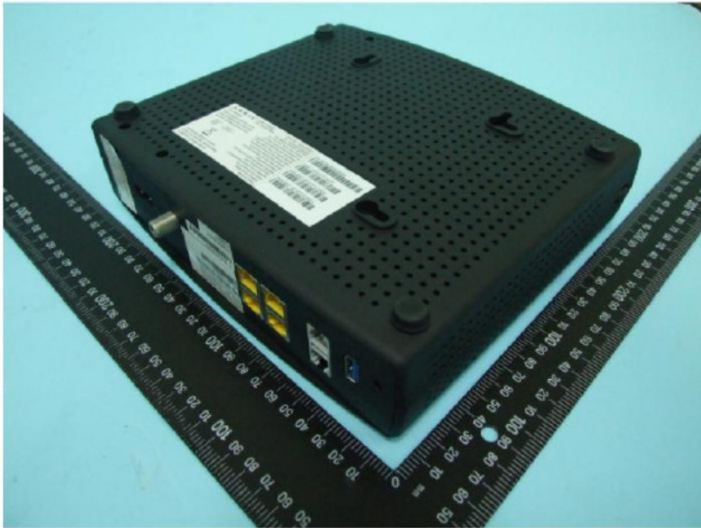
Figure 3: TG862G – Bottom