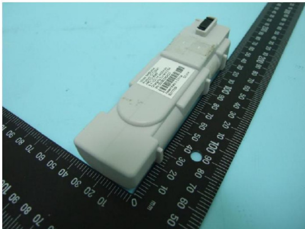
Figure 9: Battery - Back