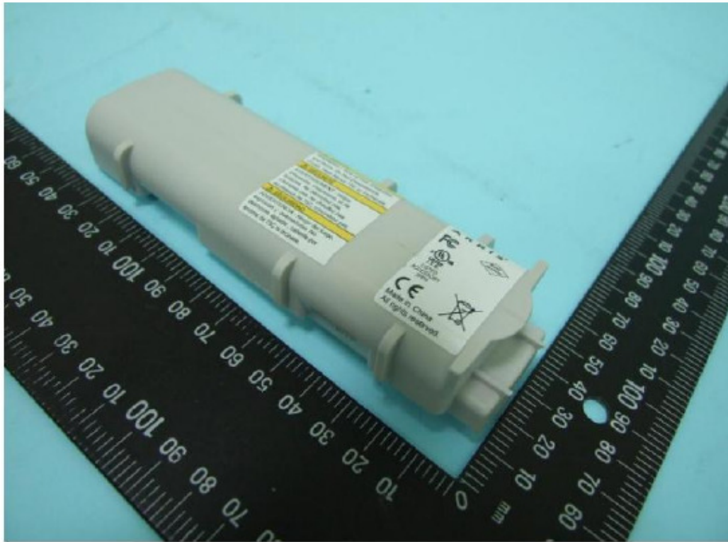
Figure 8: Battery Front