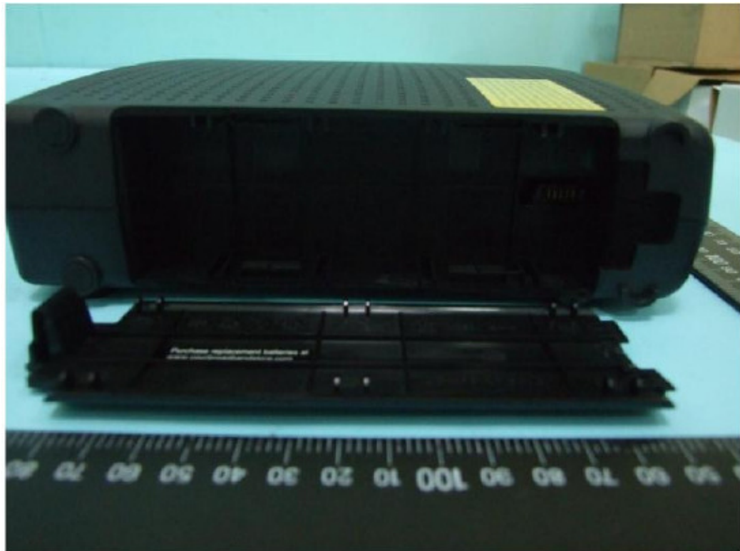
Figure 2: TG862G – Side – Battery Location