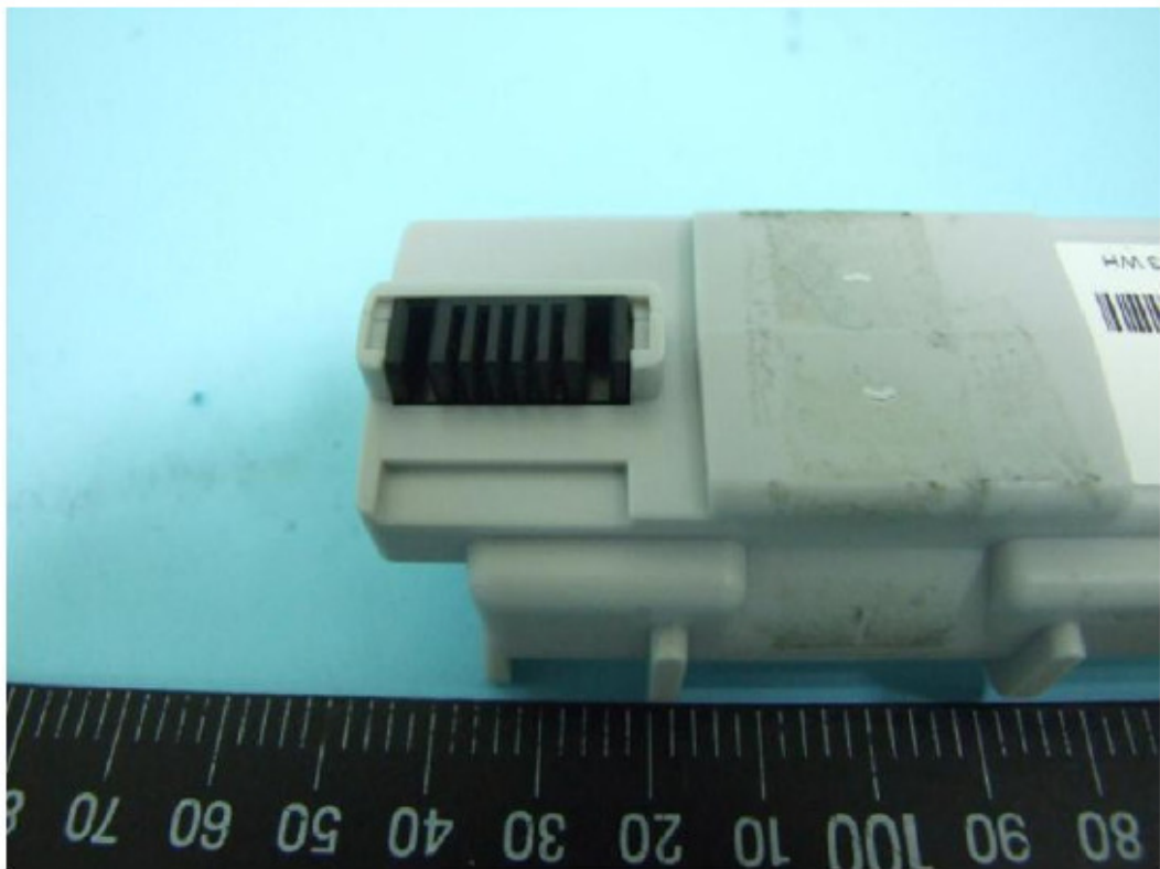
Figure 10: Close-up of Battery End