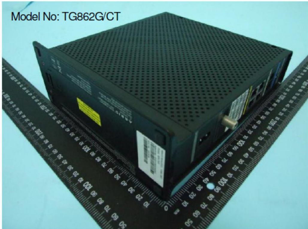
Figure 5: TG862G/CT – Top