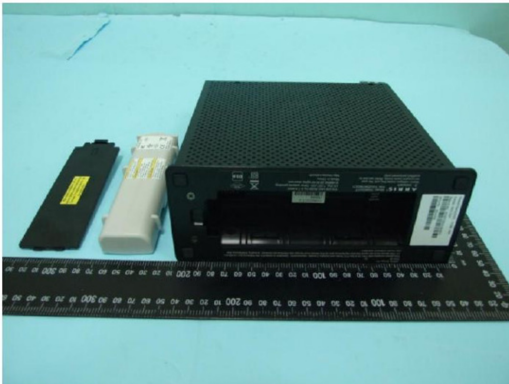
Figure 7: TG862G/CT with Battery