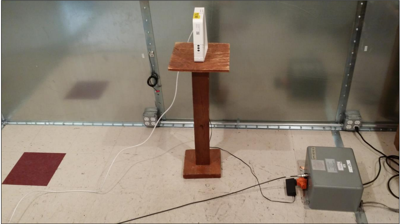
Photograph 1. Conducted Emissions, 15.207(a), Test Setup