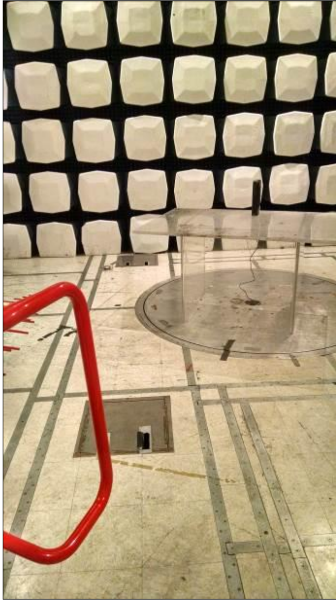
Photograph 1. Radiated Spurious Emissions, Test Setup, 30 MHz – 1 GHz