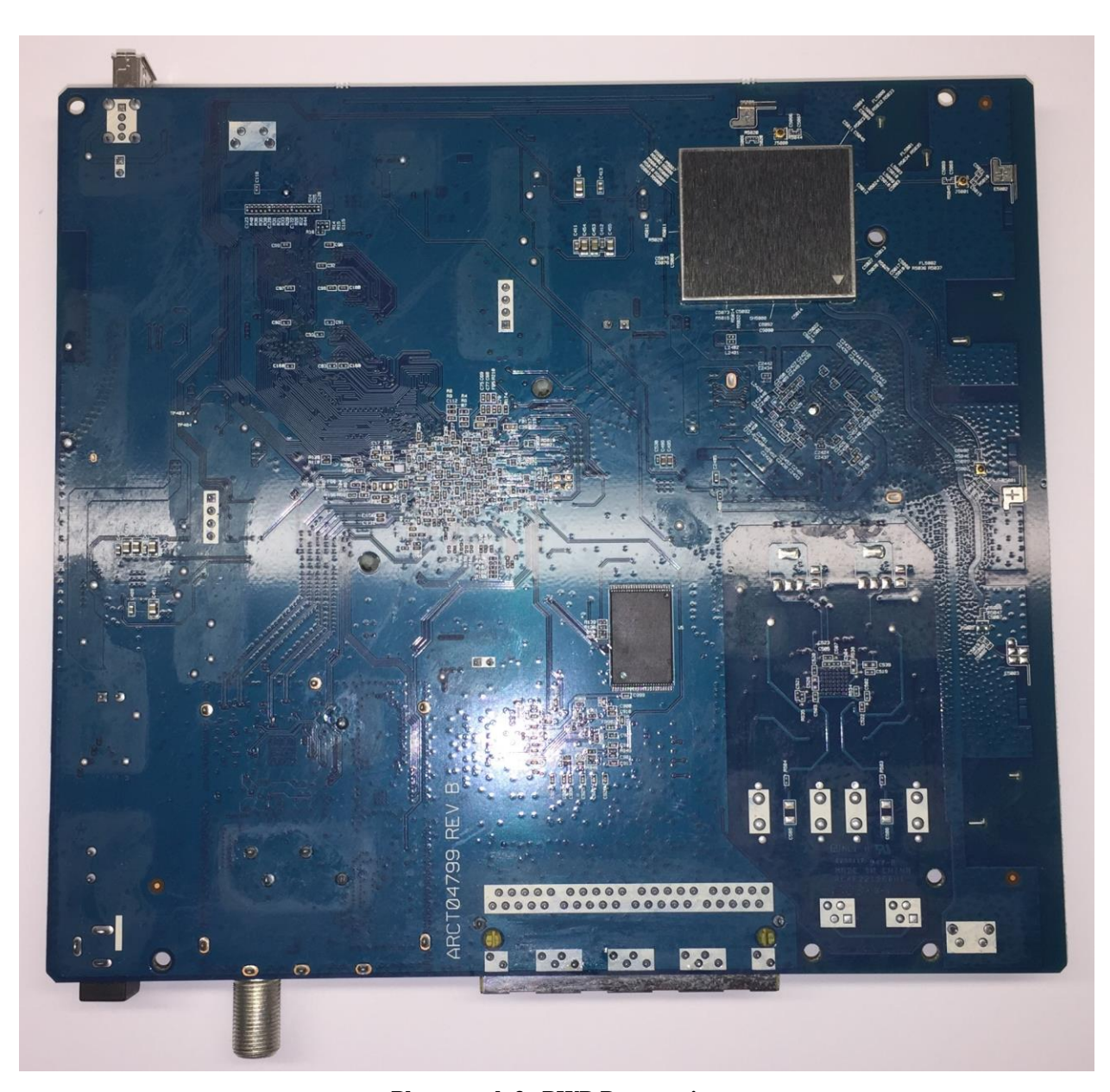
Photograph 3. PWB Bottom view