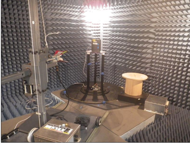
Photograph 3. Radiated Spurious Emissions, Test Setup, Above 1 GHz