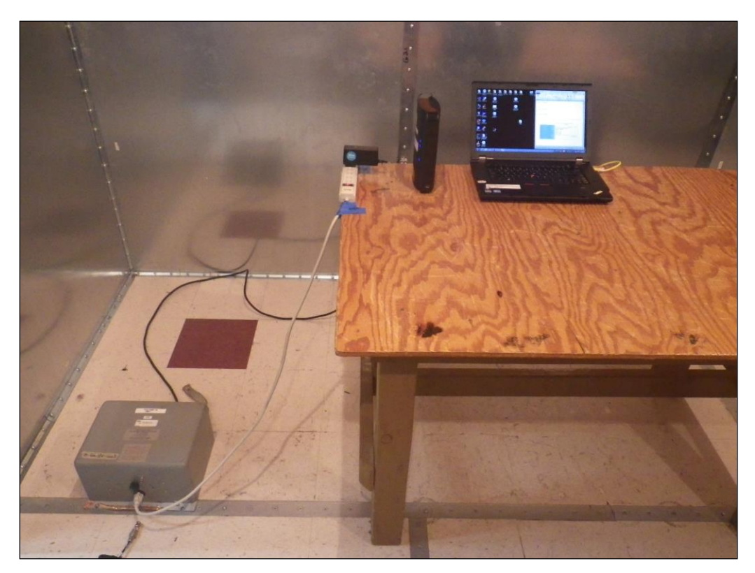
Photograph 1. Conducted Emissions, 15.207(a), Test Setup