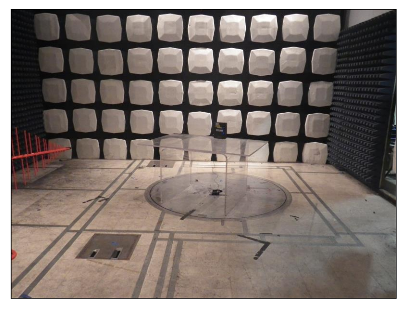
Photograph 2. Radiated Spurious Emissions, Test Setup, Below 1 GHz