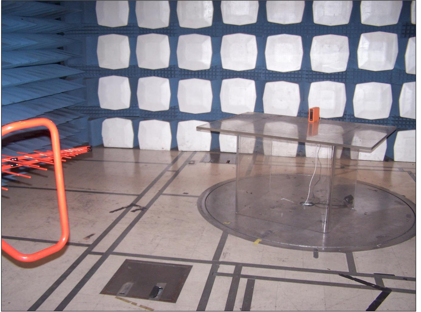
Photograph 2. Radiated Emissions, Test Setup