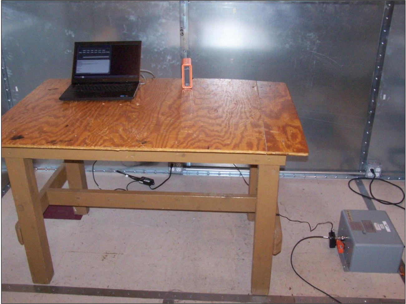
Photograph 3. Conducted Emissions, 15.207(a), Test Setup