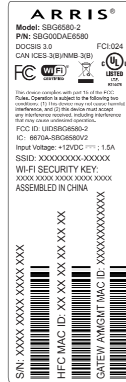
Unit label Scale: 1:1