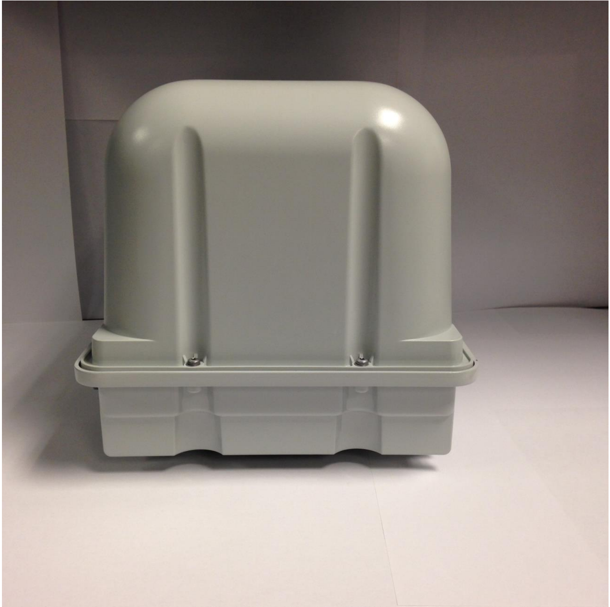
Photograph 2. Side Right