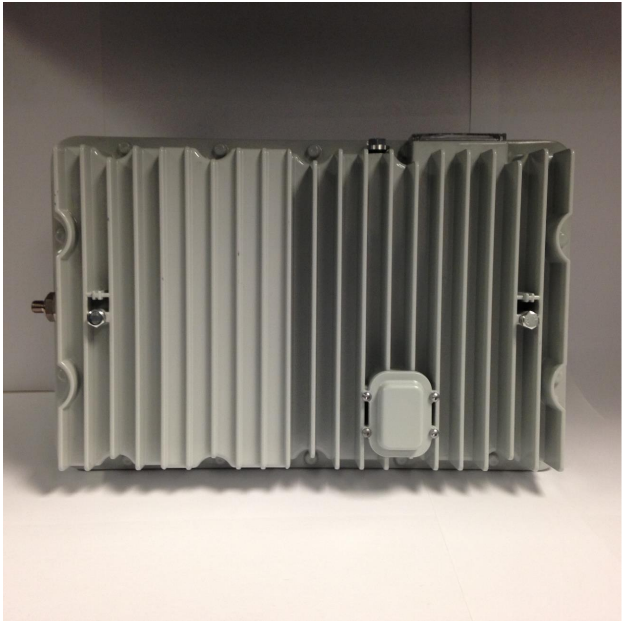
Photograph 6. Bottom