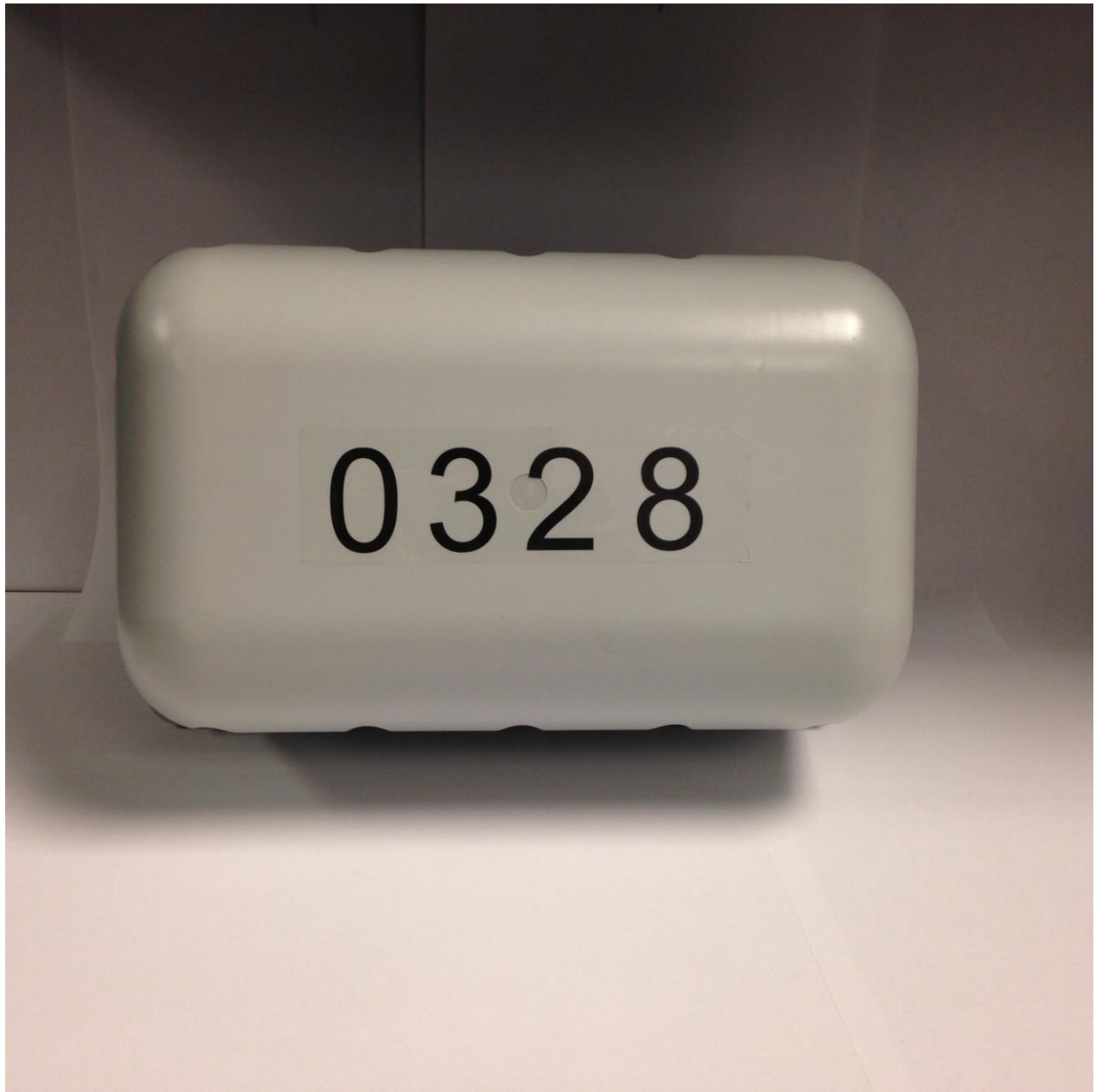
Photograph 5. Top