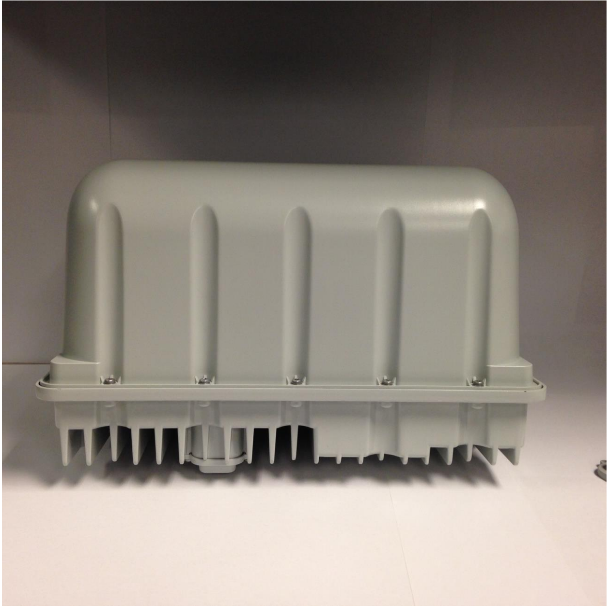
Photograph 3. Rear