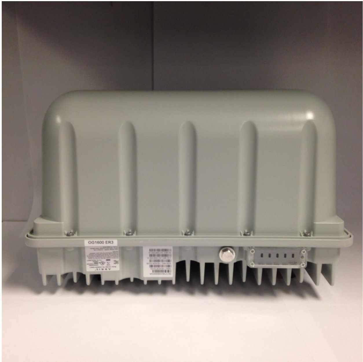
Photograph 1. Front