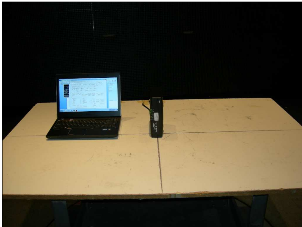
Figure 1: Radiated Emissions