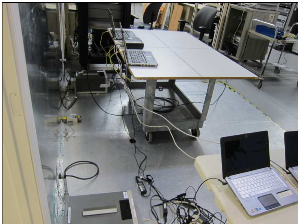
Figure 4: Conducted Emissions