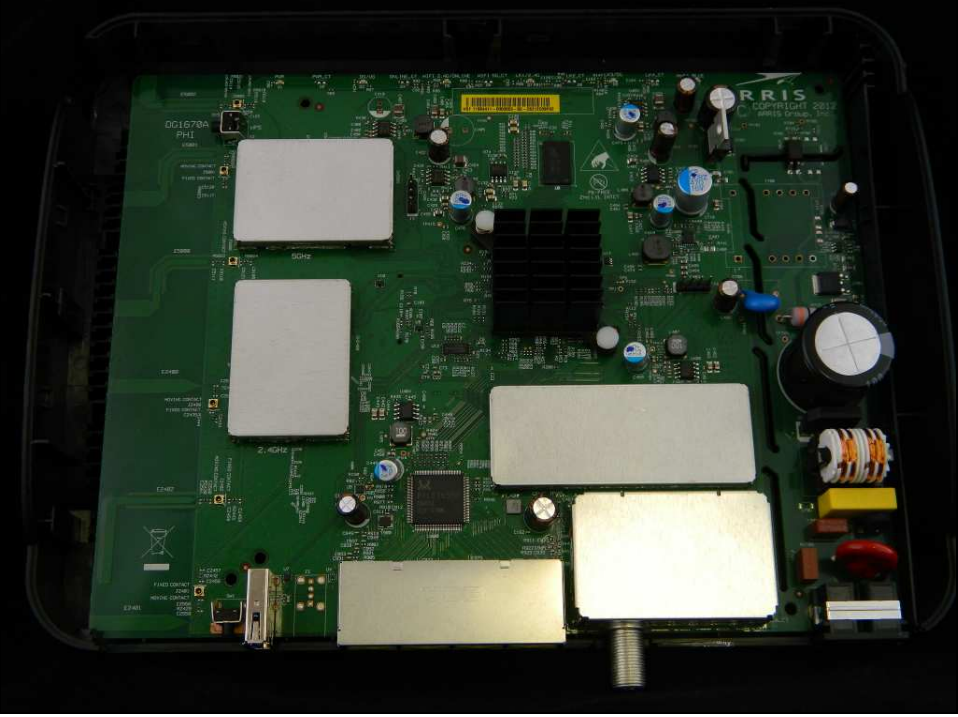
Figure 1: Internal Photo