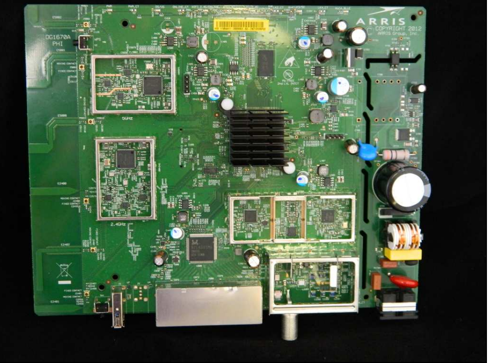
Figure 3: Internal Photo – DG1670A – Shields Removed