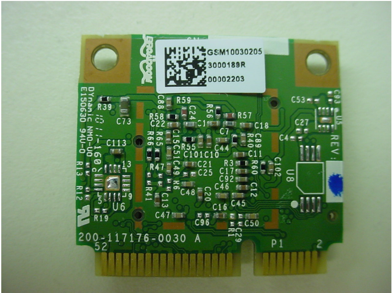
Figure 3: PCB - Back