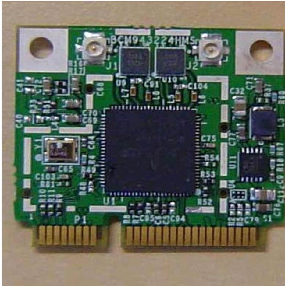
Figure 2: PCB without Shields - Front