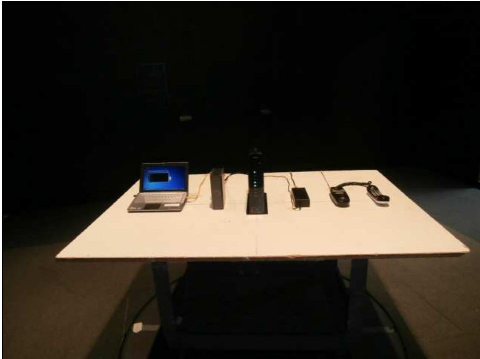
Figure 1: Radiated Emissions – Zigbee