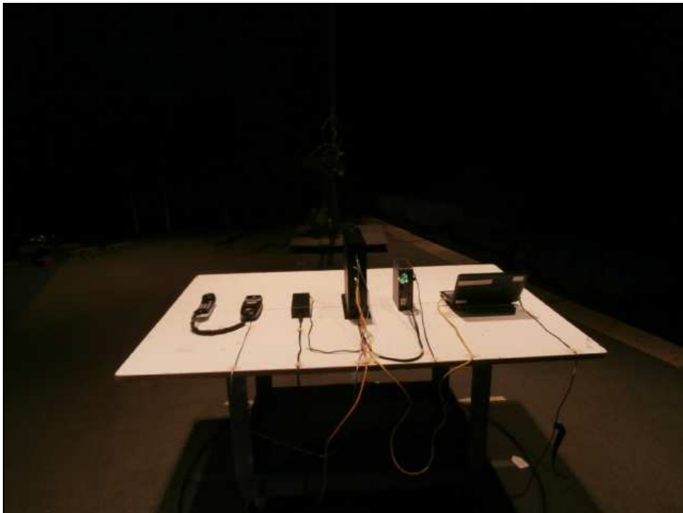
Figure 2: Radiated Emissions – Zigbee