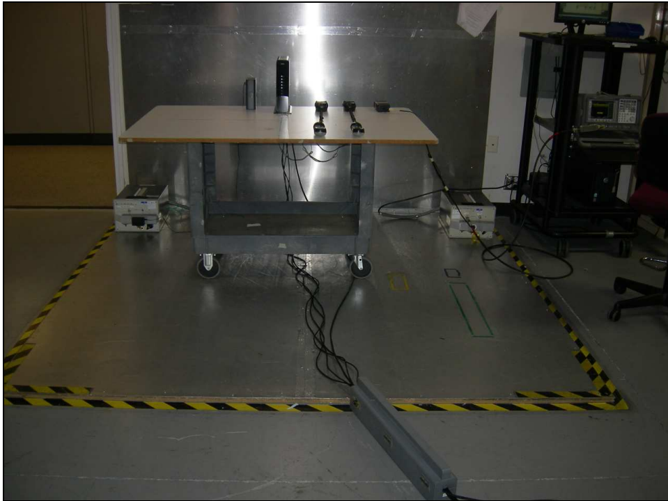
Figure 3: Conducted Emissions