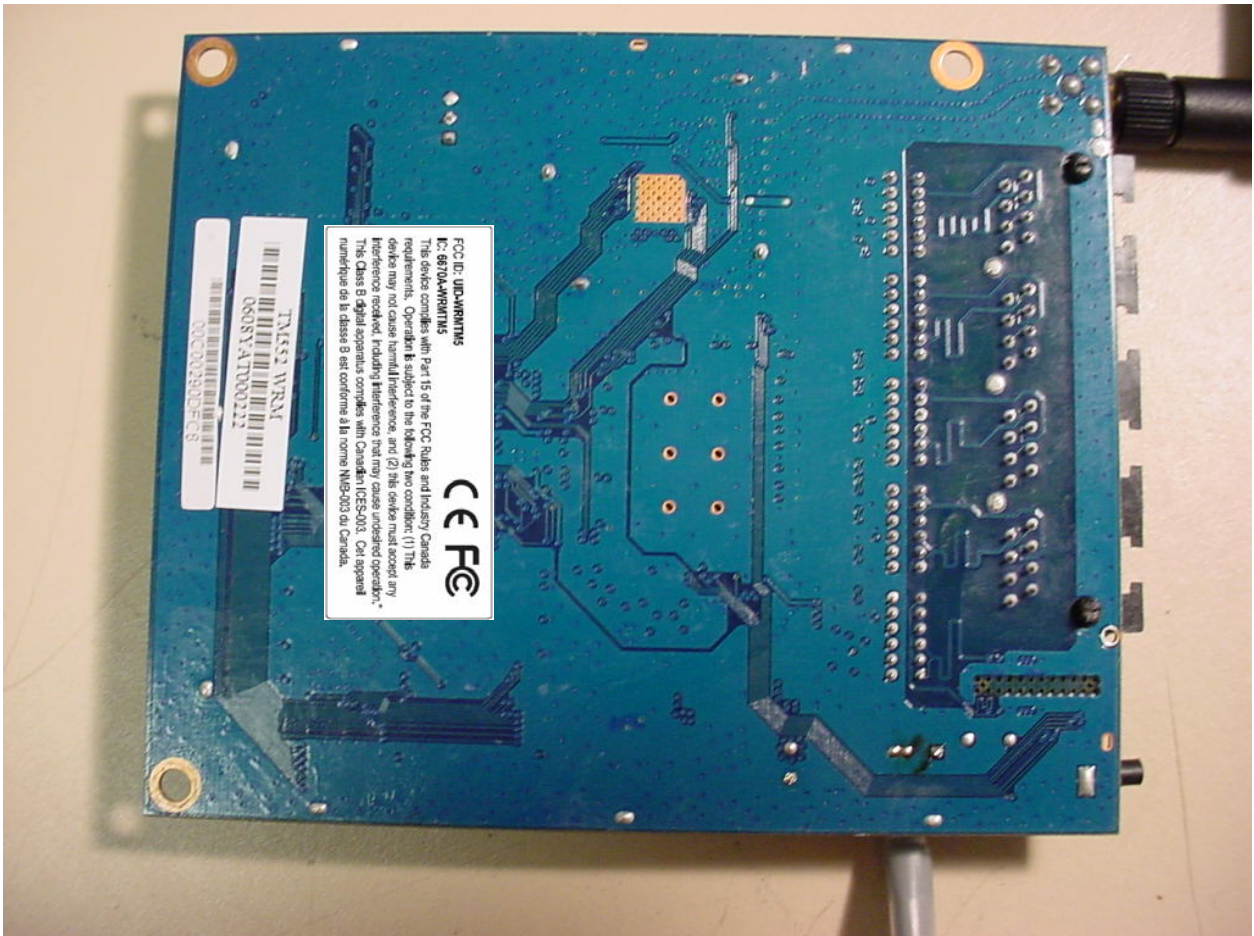
Figure 2: Module Label Location